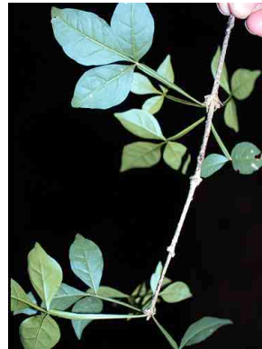
9 Parmentiera acutifolia BIGNONIACEAE