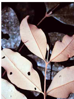
28 Eugenia aeruginea MYRTACEAE