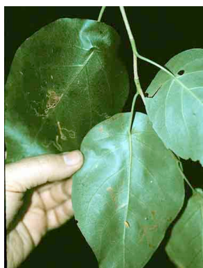
33 Coccoloba acapulcensis POLYGONACEAE