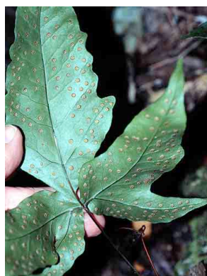
39 Tectaria heracleifolia PTERIDOPHYTA