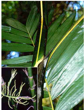
6 Chamaedorea tepajilote ARECACEAE