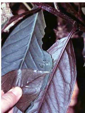
27 Ardisia MYRSINACEAE