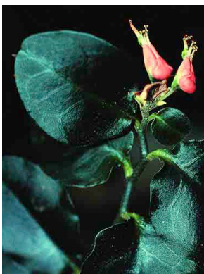
17 Pedilanthus EUPHORBIACEAE