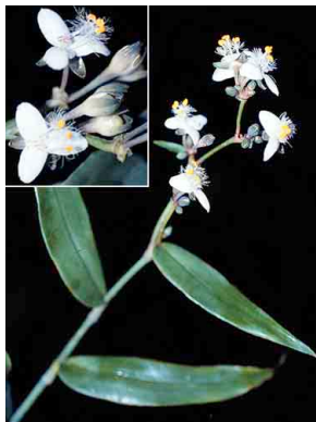
13 Tripogandra grandiflora COMMELINACEAE