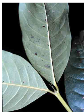
34 Faramaea occidentalis RUBIACEAE