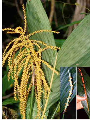
4 Chamaedorea ernesti-augusti ARECACEAE