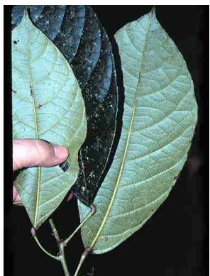
16 Cleidion oblongifolium EUPHORBIACEAE