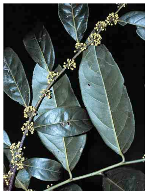
20 Casearia sylvestris FLACOURTIACEAE