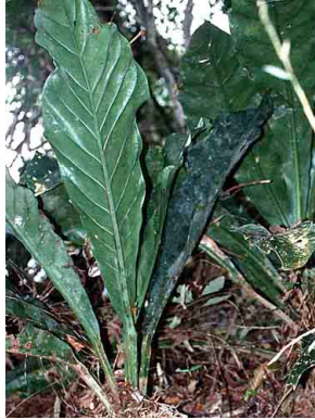
2 Anthurium schlechtendalii ARACEAE