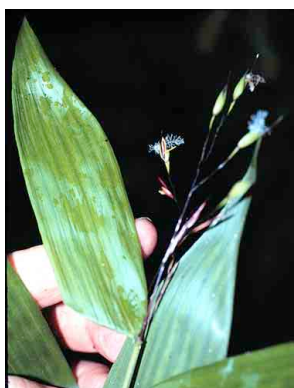
32 Olyra POACEAE