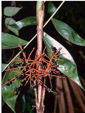
7 Chamaedorea ARECACEAE