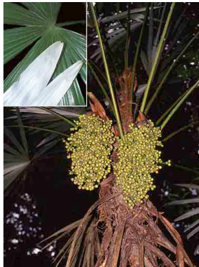
8 Cryosophila stauracantha ARECACEAE