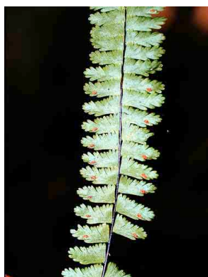
38 Asplenium monanthes PTERIDOPHYTA