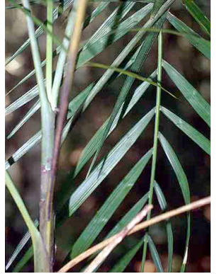
5 Chamaedorea graminifolia ARECACEAE