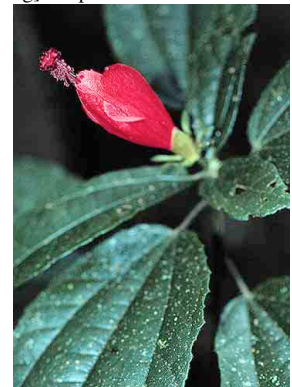
24 Malvaviscus arborescens MALVACEAE