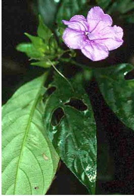
1 Ruellia matagalpae ACANTHACEAE