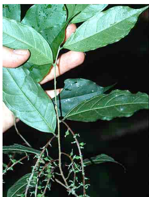
26 Trophis mexicana MORACEAE