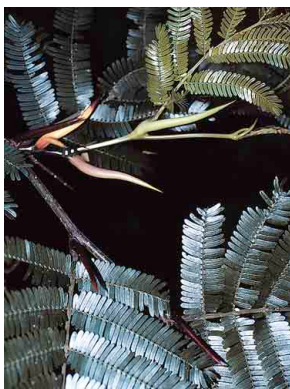
18 Acacia FABACEAE