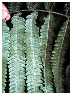
40 Thelypteris PTERIDOPHYTA