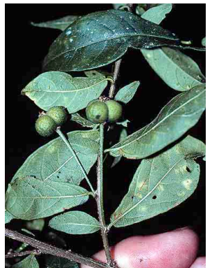
15 Adelia barbinervis EUPHORBIACEAE