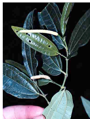
30 Piper aequale cf. PIPERACEAE