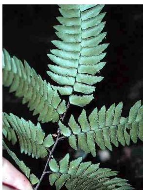
37 Adiantum PTERIDOPHYTA