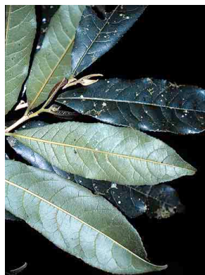
19 Casearia corymbosa FLACOURTIACEAE