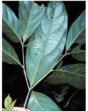
10 Cordia stellifera BORAGINACEAE