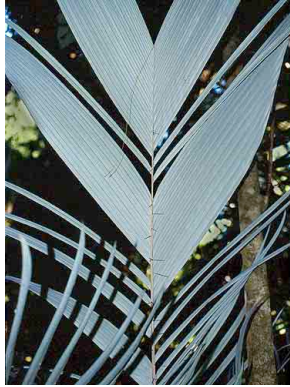
3 Astrocaryum mexicanum ARECACEAE