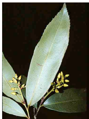
29 Ouratea lucens OCHNACEAE