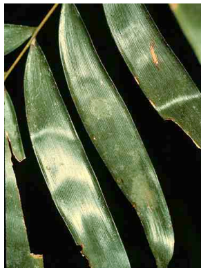
14 Zamia CYCADACEAE