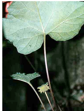
25 Dorstenia contrajerva MORACEAE