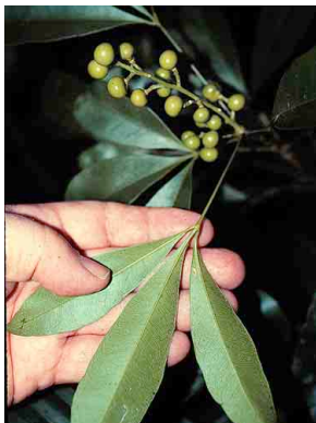
12 Forchammeria trifoliata CAPPARIDACEAE