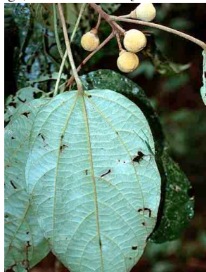
23 Hampea stipitata MALVACEAE