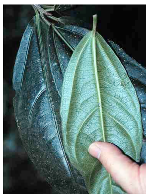
36 Myriocarpa obovata URTICACEAE