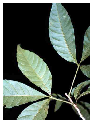
35 Allophylus SAPINDACEAE