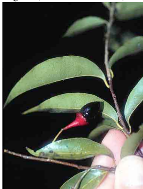
22 Licaria campecheana LAURACEAE