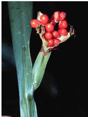
21 Neomarica variegata IRIDACEAE