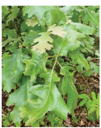
16 Black Oak Quercus velutina FAGACEAE