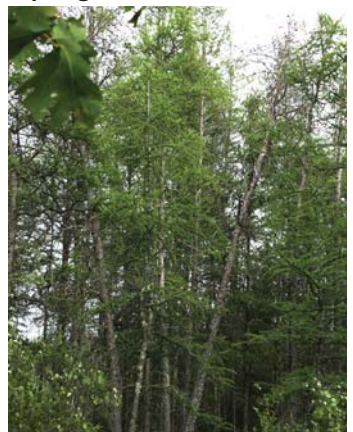
Tamarack Larix laricina PINACEAE