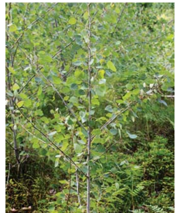
Quaking Aspen Populus tremuloides SALICACEAE