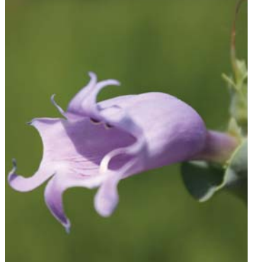
2 Large-flowered Beardtongue Penstemon grandiflorus PLANTAGINACEAE