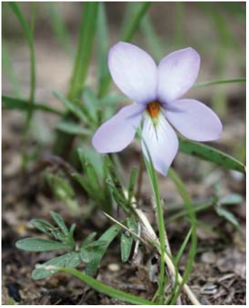
10 Bird's Foot Violet Viola pedata VIOLACEAE