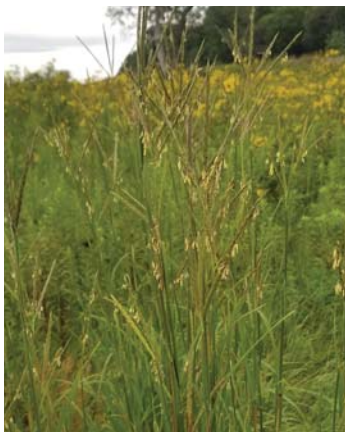
Big Bluestem Andropogon gerardii POACEAE