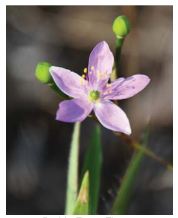
Prairie Fame Flower Phemeranthus rugospermus MONTIACEAE