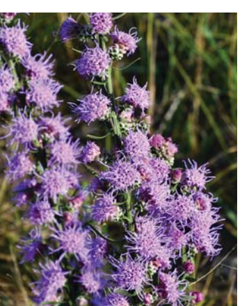
Rough Blazing Star Liatris aspera ASTERACEAE