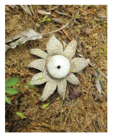
18 Earthstar Fungus Astraeus sp. DIPLOCYSTACEAE