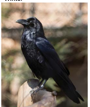
Common Raven Corvus corax CORVIDAE