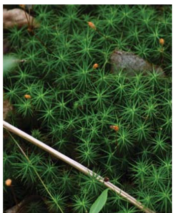
Common Hair Moss Polytrichum commune POLYTRICHACEAE