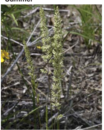
Koeleria macrantha POACEAE