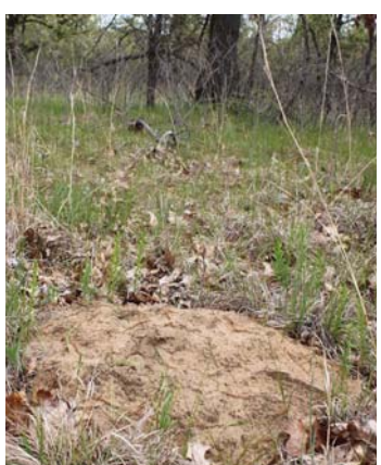
8 Plains Pocket Gopher Mounds Geomys bursurus GEOMYIDAE