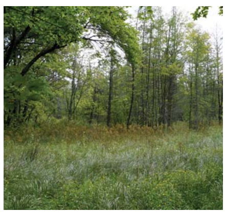
Tamarack Swamp Habitat