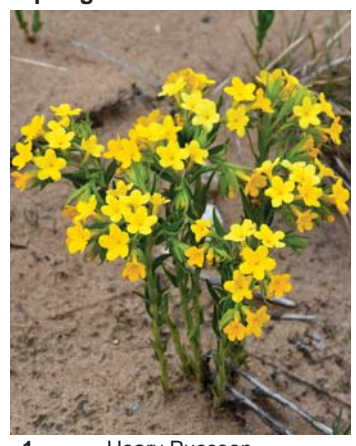
Hoary Puccoon Lithospermum canescens BORAGINACEAE