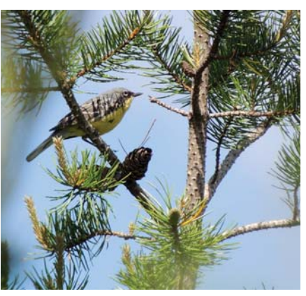
Kirtland's Warbler Setophaga kirtlandii