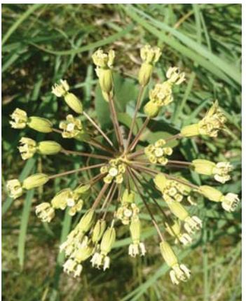
Clasping Milkweed Asclepias amplexicaulis APOCYNACEAE