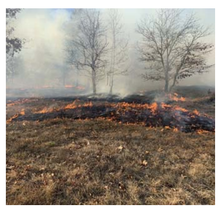
Oak Savanna/Jack Pines Prescribed Fires