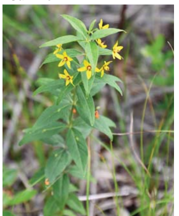
Whorled Loosestrife Lysimachia quadrifolia PRIMULACEAE