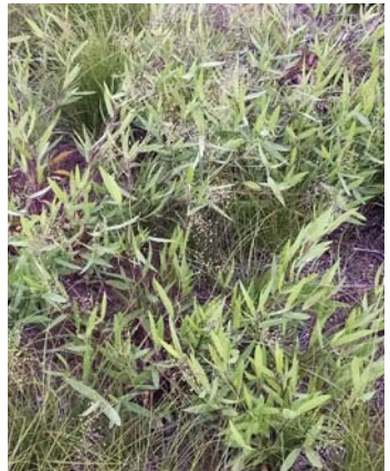
21 Scribner's Switch Grass Dichanthelium scribnerianum POACEAE