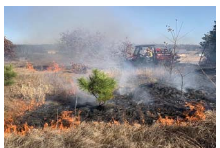
Sand Prairie Prescribed Fires

Sand prairies once covered large swaths of Wisconsin's Central Sands. Only a small portion remains with ecological integrity, with an even tinier fraction in high-quality condition. Sand prairies have less than 10% tree cover, but ample grass or sedge ground cover. Many natural disturbances—mainly landscape wildfires, but also wind blowouts, and flooding rivers and streams—played a key role in the evolution of this habitat. Among the dense mats of grasses and grass-like plants grow many forbs—plants with showy flowers—including sand specialists, such as the Large-flowered Beardtongue. The grasses and sedges are about 1 to 2 feet tall. While large mammals are still mostly missing, sand prairies are home to smaller mammals such as Franklin's ground squirrel, uncommon birds such as Upland Sandpiper and Grasshopper Sparrow, and rare reptiles such as the slender glass lizard. The many rare plants host specialized insects that evolved with those plants, such as the endangered Persius Duskywing butterfly.