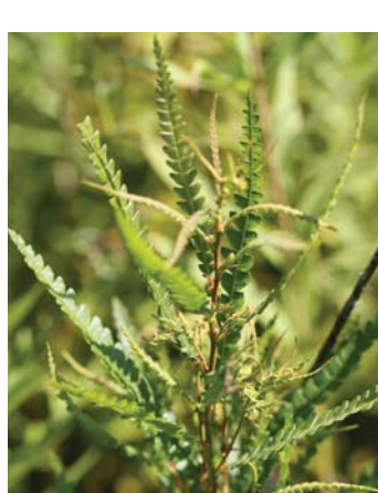
32 Sweetfern Comptonia peregrina MYRICACEAE