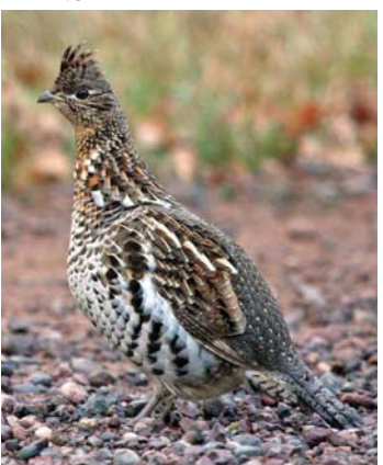
Ruffed Grouse Bonasa umbellus PHASIANIDAE