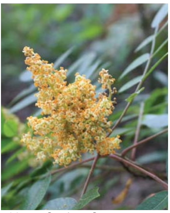
Staghorn Sumac Rhus typhinus ANACARDIACEAE