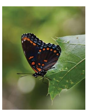
30 Red-spotted Purple Butterfly Limenitis arthemis NYMPHALIDAE