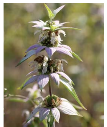
Spotted Bee-balm 12 Monarda punctata LAMIACEAE