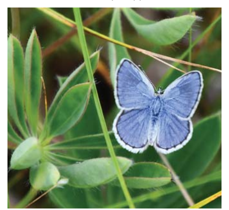
Karner Blue Butterfly Lycaeides melissa samuelis