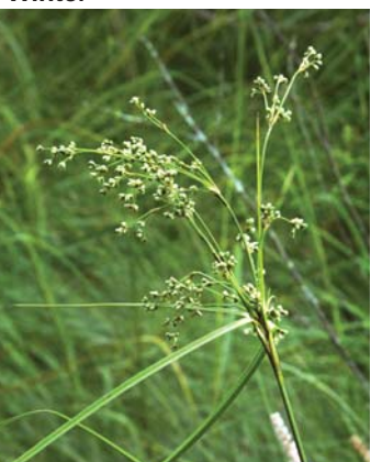
Red Bullrush Scirpus pendulus CYPERACEAE