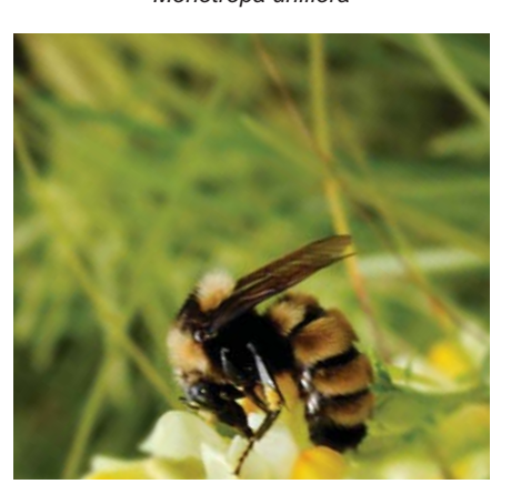
Northern Amber Bumble Bee Bombus borealis