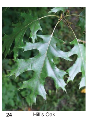
Hill's Oak Quercus ellipsoidalis FAGACEAE