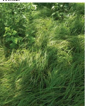
Pennsylvania Sedge Carex pensylvanica CYPERACEAE