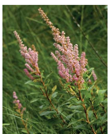
28 Eastern Hardhack Spiraea tomentosa ROSACEAE