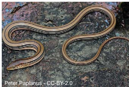
Slender Glass Lizard Ophisaurus attenuatus