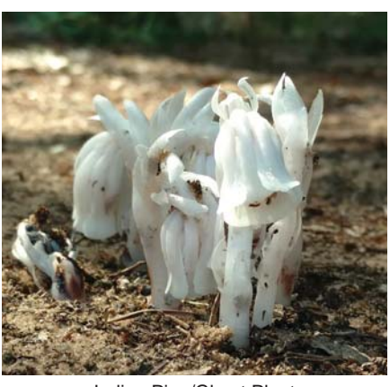
Indian Pipe/Ghost Plant Monotropa uniflora