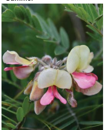
Goat's Rue Tephrosia virginiana FABACEAE