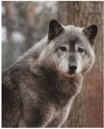
Gray Wolf 13 Canis lupus CANIDAE