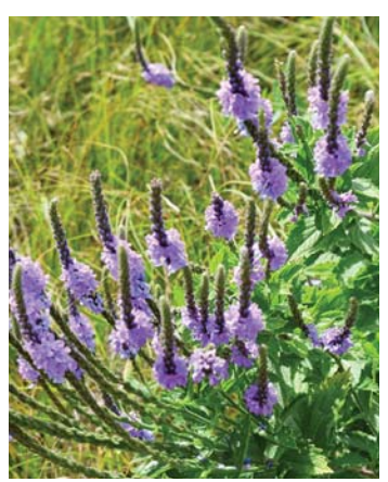
Hoary Vervain Verbena stricta VERBENACEAE