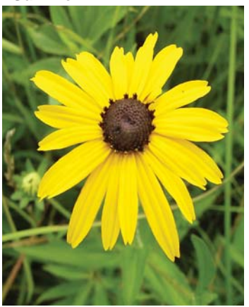
Black-eyed Susan Rudbeckia sp. ASTERACEAE