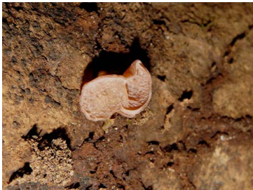
1 Auricularia delicata Auriculariales, Auriculariaceae (B)

[fieldguides.fieldmuseum.org] [929] version 1 9/2017