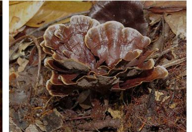
24 Hymenochaete damicornis Hymenochaetales, Hymenochaetaceae (B)