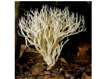
47 Scytinopogon angulisporus var. gracilis Agaricales, Clavariaceae (B)