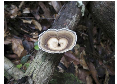
52 Trametes elegans Polyporales, Polyporaceae (B)