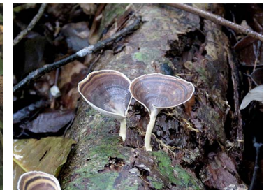
12 Flabellophora obovata Polyporales, Polyporaceae (B)