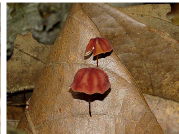
31 Marasmius haematocephalus complex sp. 2 Agaricales, Marasmiaceae (B)