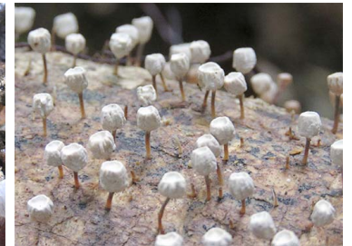
4 Caripia montagnei Agaricales, Omphalotaceae (B)