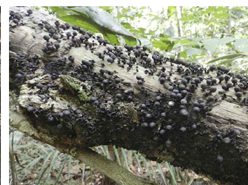
39 Phylacia poculiformis Xylariales, Xylariaceae (A)