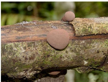
9 Daldinia concentrica Xylariales, Xylariaceae (A)