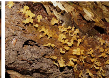
8 Dacryopinax spatularia Dacrymycetales, Dacrymycetaceae (B)