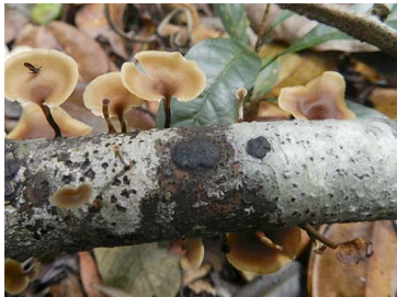
41 Polyporus leprieurii Polyporales, Polyporaceae (B)

[fieldguides.fieldmuseum.org] [929] version 1 9/2017