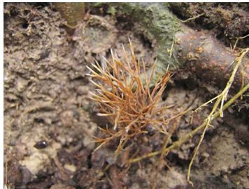
43 Pterula cf. multifida Agaricales, Pterulaceae (B)