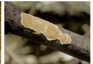
32 Megasporoporia cavernulosa Polyporales, Polyporaceae (B)