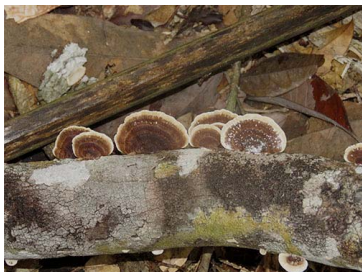
53 Trametes versicolor Polyporales, Polyporaceae (B)