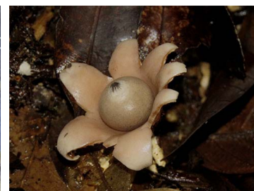
19 Geastrum cf. hirsutum Geastrales, Geastraceae (B)