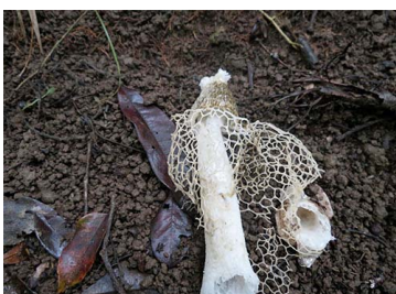
37 Phallus indusiatus Phallales, Phallaceae (B)