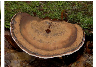
16 Ganoderma applanatum Polyporales, Ganodermataceae (B, P)