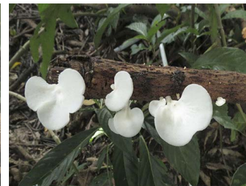
11 Favolus tenuiculus Polyporales, Polyporaceae (B, H)