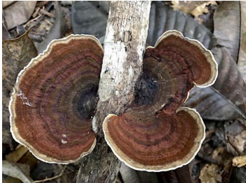
21 Hexagonia papyracea Polyporales, Polyporaceae (B, P)

[fieldguides.fieldmuseum.org] [929] version 1 9/2017