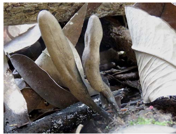
54 Xylaria polymorpha Xylariales, Xylariaceae (A)