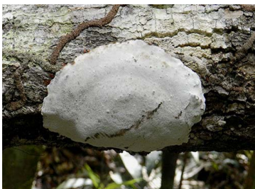
33 Perenniporia inflexibilis Polyporales, Polyporaceae (B)