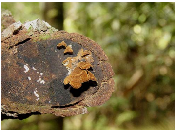
25 Hymenochaete rubiginosa Hymenochaetales, Hymenochaetaceae (B)