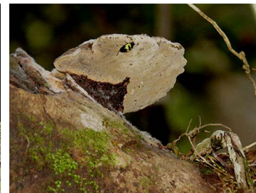
15 Fomes fasciatus Polyporales, Polyporaceae (B, H)