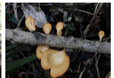
40 Polyporus grammocephalus Polyporales, Polyporaceae (B)