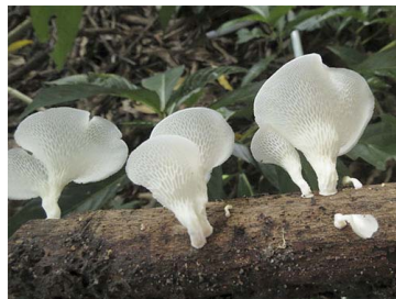
10 Favolus tenuiculus Polyporales, Polyporaceae (B, P)