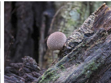
27 Lycoperdon cf. umbrinum Agaricales, Agaricaceae (B)