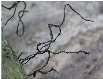
51 Thamnomycetes chordalis Xylariales, Xylariaceae (B)