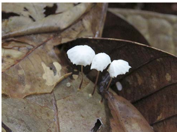
29 Marasmius cf. haediniformis Agaricales, Marasmiaceae (B)