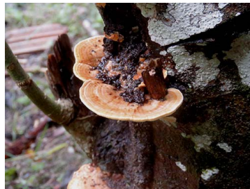
46 Rigidoporus lineatus Polyporales, Meripilaceae (B)