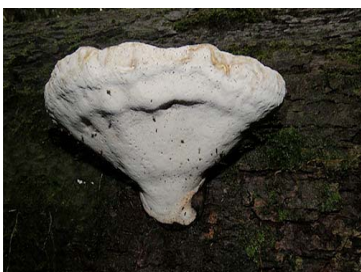
17 Ganoderma applanatum Polyporales, Ganodermataceae (B, H)