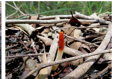
28 Mutinus caninus Phallales, Phallaceae (B)