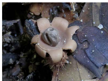
18 Geastrum fimbriatum Geastrales, Geastraceae (B)