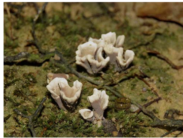
50 Stereopsis radicans Polyporales, Meruliceae (B)