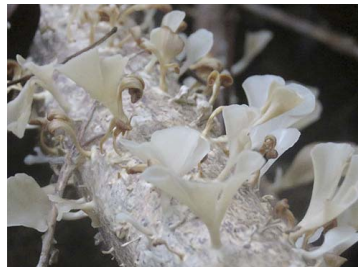
26 Inflatostereum glabrum Polyporales, Phanerochaetaceae (B)