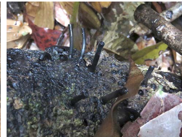
3 Camillea leprieurii Xylariales, Xylariaceae (A)