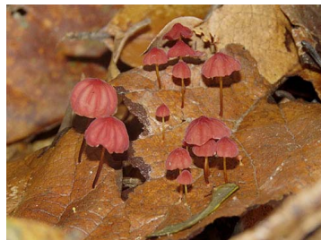
30 Marasmius haematocephalus complex sp. 1 Agaricales, Marasmiaceae (B)