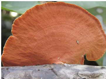
45 Pycnoporus sanguineus Polyporales, Polyporaceae (B, H)