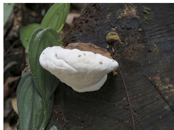
34 Perenniporia martia Polyporales, Polyporaceae (B)