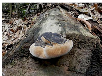
38 Phellinus robustus Hymenochaetales, Hymenochaetaceae (B)