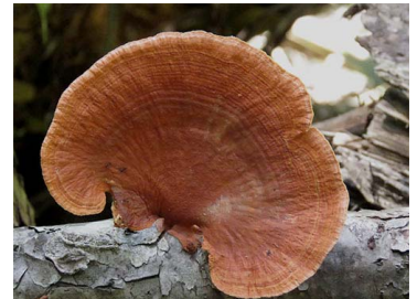
44 Pycnoporus sanguineus Polyporales, Polyporaceae (B, P)