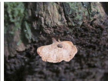
35 Perenniporia stipitata Polyporales, Polyporaceae (B)