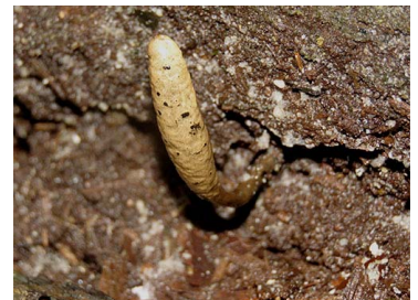
55 Xylaria polymorpha Xylariales, Xylariaceae (A)