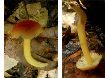
23 Hygrocybe martinicensis Agaricales, Tricholomataceae (B, P, H)