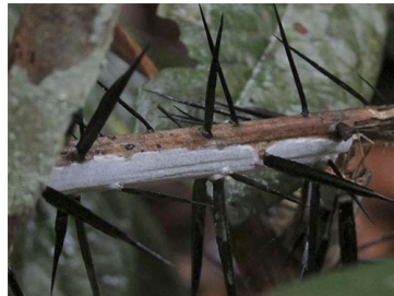
42 Porogramme albocincta Polyporales, Grammotheleaceae (B)