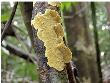
13 Flavodon flavus Polyporales, Meruliaceae (B, H)