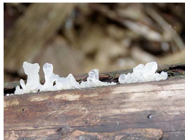
53 Tremella fuciformis Tremellales, Tremellaceae (B)