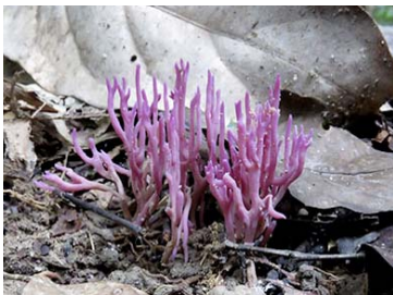
5 Clavaria zollingeri Agaricales, Clavariaceae (B)