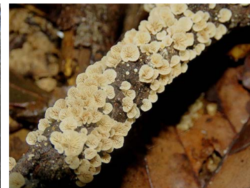
7 Crepidotus cf. variabilis Agaricales, Inocybaceae (B)