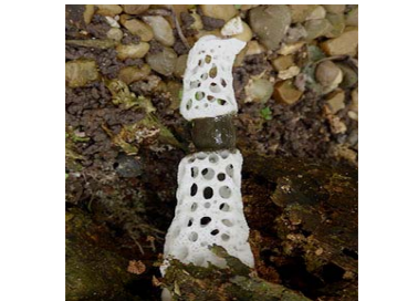
48 Staheliomyces cinctus Phallales, Phallaceae (B) ©Lynn Delesat