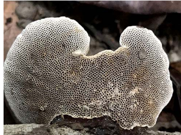
22 Hexagonia papyracea Polyporales, Polyporaceae (B, H)