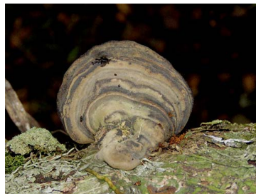
14 Fomes fasciatus Polyporales, Polyporaceae (B, P)