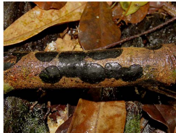
2 Camillea leprieurii Xylariales, Xylariaceae (A)