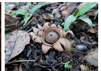
20 Geastrum triplex Geastrales, Geastraceae (B)