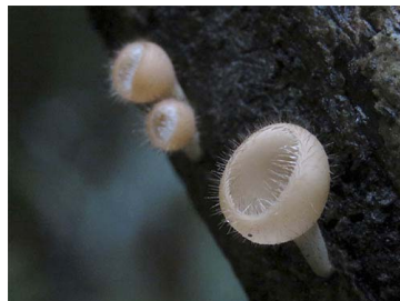
6 Cookeina tricholoma Pezizales, Sarcoscyphaceae (A)