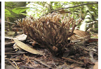
36 Phaeoclavulina cyanocephala Gomphales, Gomphaceae (B)