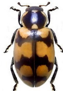
11 Eriopis chilensis