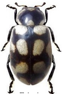
13 Eriopis loaensis