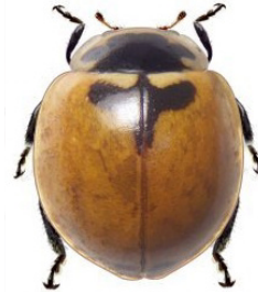
3 Adalia deficiens