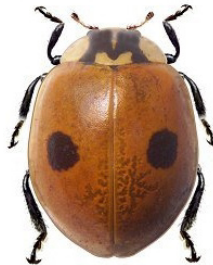
2 Adalia bipunctata