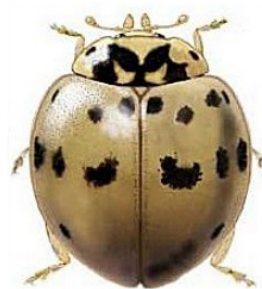
27 Olla v-nigrum