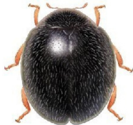
34 Parastethorus histrio