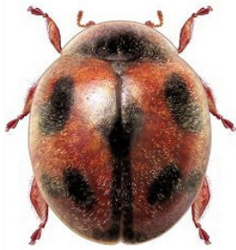
37 Novius cardinalis