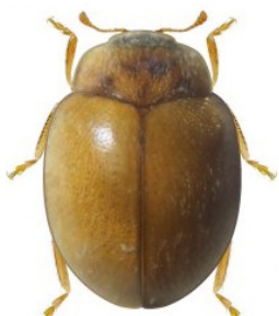
26 Nothocolus sp.