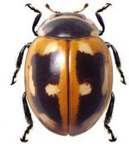
8 Cycloneda germainii