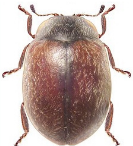
25 Nothocolus sicardi