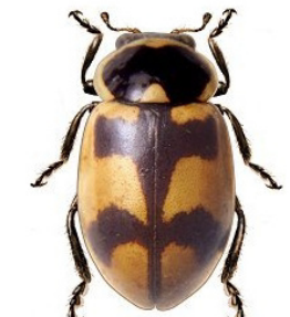
12 Eriopis eschscholtzii