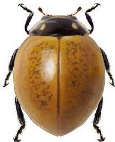
9 Cycloneda limbicollis