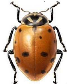
19 Hippodamia convergens