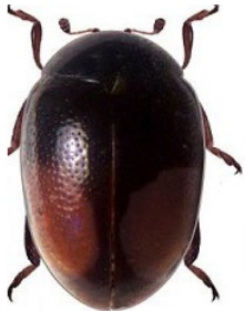
33 Parasidis brethesi