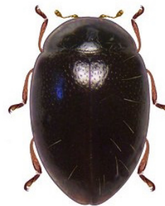
41 Stictospilus darwini