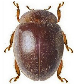
36 Rhyzobius sp.