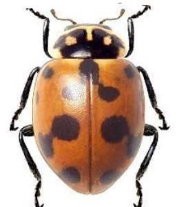
20 Hippodamia variegata