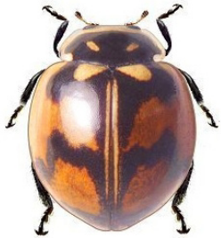
1 Adalia angulifera