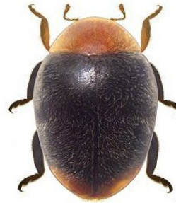
7 Cryptolaemus montrouzieri