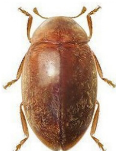
30 Orynipus kuscheli