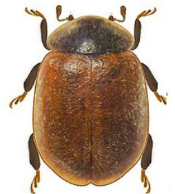
24 Neoryssomus variabilis