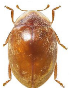
28 Orynipus chilensis