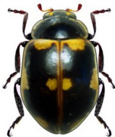
10 Cycloneda patagonica