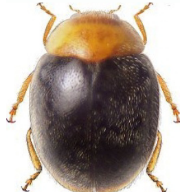
38 Scymnus bicolor