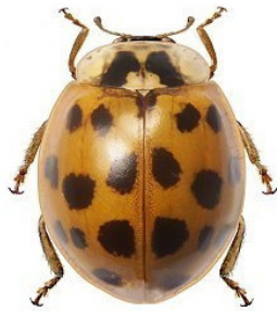
18 Harmonia axyridis