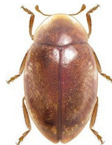
31 Orynipus ultimensis