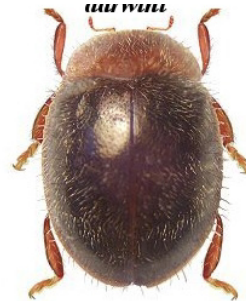
35 Rhyzobius lophanthae