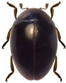
5 Coccidophilus sp.