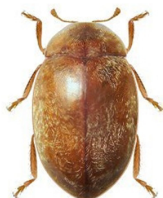
29 Orynipus darwini