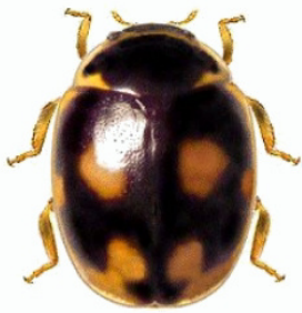
21 Hyperaspis festiva