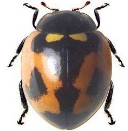
4 Adalia kuscheli