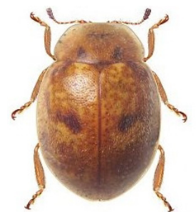
32 Paracranoryssus chilianus