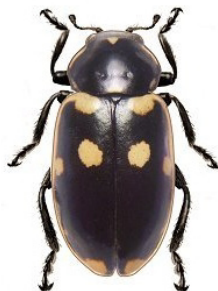
14 Eriopis magellanica