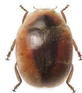
39 Scymnus loewii