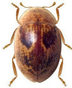
6 Cranoryssus variegatus