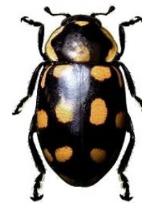
15 Eriopis opposita