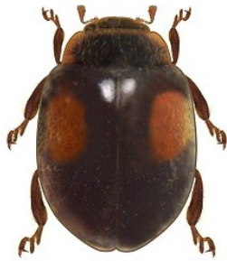
22 Neorhizobius fuegensis