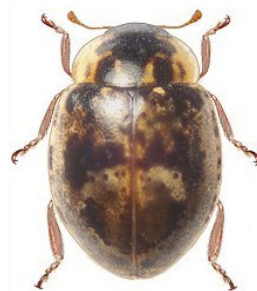
40 Stenadalia nigrodorsata