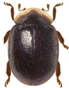
23 Neoryssomus germainii