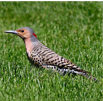
Northern Flicker Colaptes auratus PICIDAE