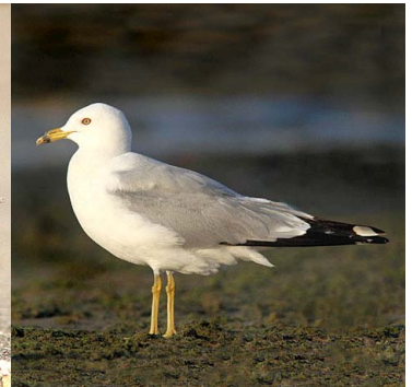
Ring-billed Gull Larus delawarensis (adult) LARIDAE