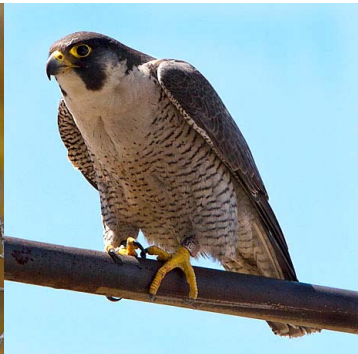
Peregrine Falcon Falco peregrinus FALCONIDAE