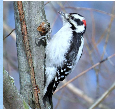
Downy Woodpecker Picoides pubescens PICIDAE