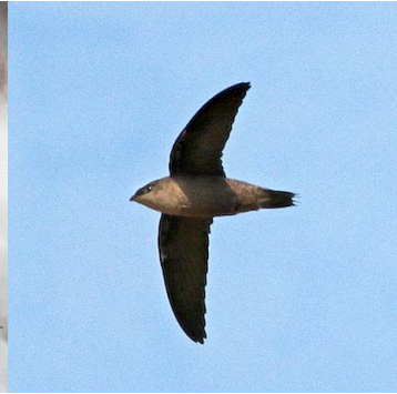
Chimney Swift Chaetura pelagica APODIDAE