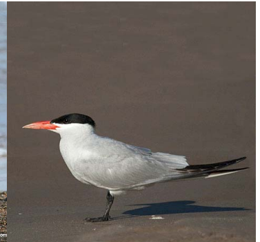
Caspian Tern Hydroprogne caspia LARIDAE