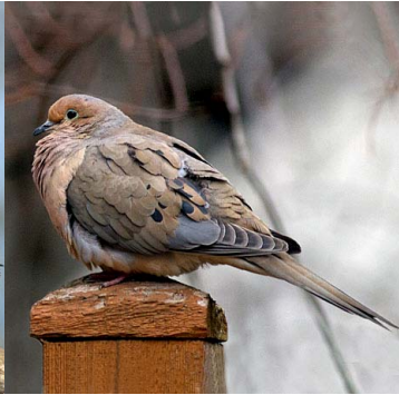
Mourning Dove Zenaida macroura COLUMBIDAE