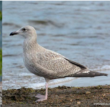
Herring Gull Larus argentatus (juv.) LARIDAE