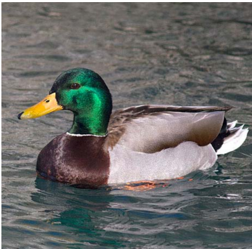
Mallard Anas platyrhynchos (male) ANATIDAE