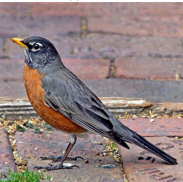
American Robin Turdus migratorius TURDIDAE