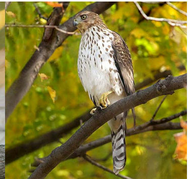
Cooper's Hawk Accipiter cooperii (juv.) ACCIPITRIDAE