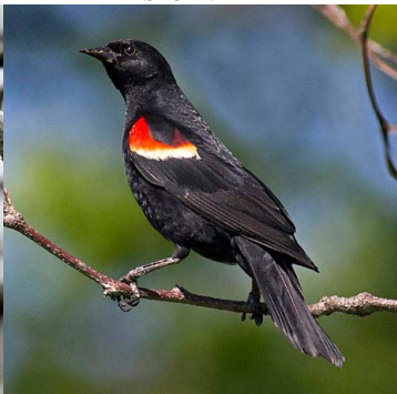
Red-winged Blackbird Agelaius phoeniceus (male) ICTERIDAE