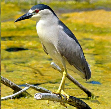
Black-crowned Night-heron Nycticorax nycticorax (adult) ARDEIDAE