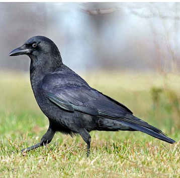
American Crow Corvus brachyrhynchos CORVIDAE