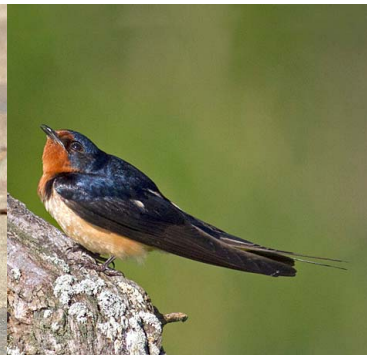
Barn Swallow Hirundo rustica HIRUNDINIDAE