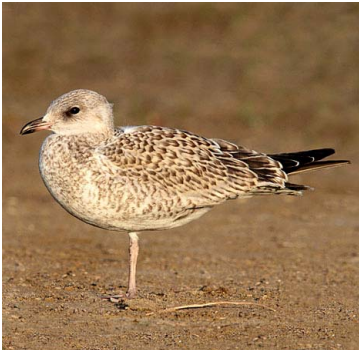
Ring-billed Gull Larus delawarensis (juv.) LARIDAE