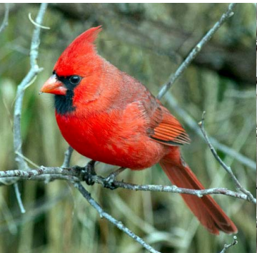
Northern Cardinal Cardinalis cardinalis (male) CARDINALIDAE