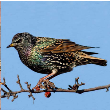
European Starling Sturnus vulgaris (adult) STURNIDAE