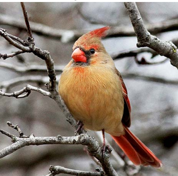
Northern Cardinal Cardinalis cardinalis (female) CARDINALIDAE