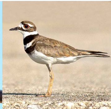
Killdeer Charadrius vociferus CHARADRIIDAE