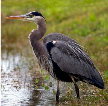
Great Blue Heron Ardea herodias ARDEIDAE