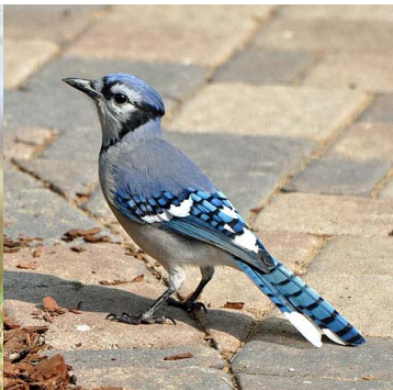
Blue Jay Cyanocitta cristata CORVIDAE