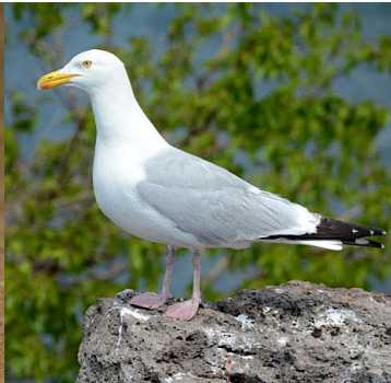
Herring Gull Larus argentatus (adult) LARIDAE