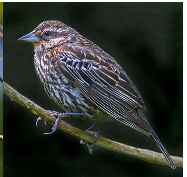
Red-winged Blackbird Agelaius phoeniceus (female) ICTERIDAE