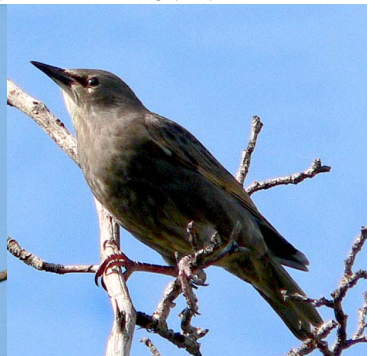
European Starling Sturnus vulgaris (juv.) STURNIDAE