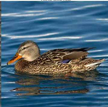
Mallard Anas platyrhynchos (female) ANATIDAE