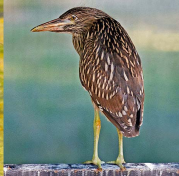
Black-crowned Night-heron Nycticorax nycticorax (juv.) ARDEIDAE