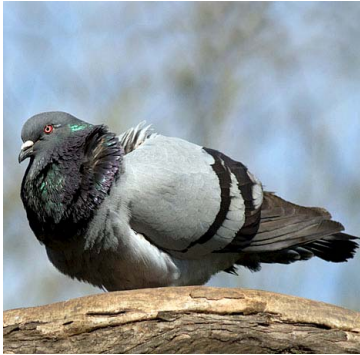
Rock Pigeon Columba livia COLUMBIDAE