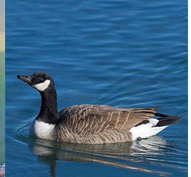
Canada Goose Branta canadensis ANATIDAE