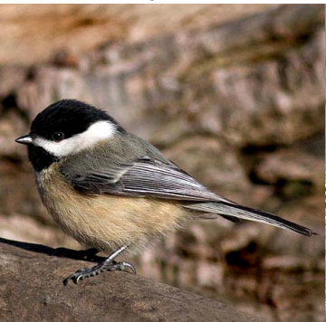
Black-capped Chickadee Poecile atricapillus PARIDAE