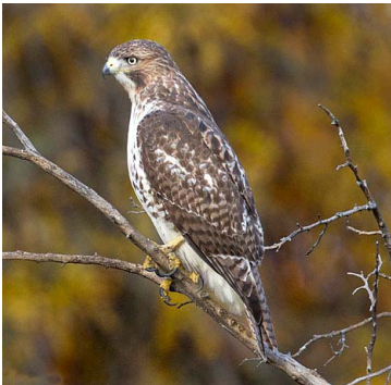
Red-tailed Hawk Buteo jamaicensis ACCIPITRIDAE