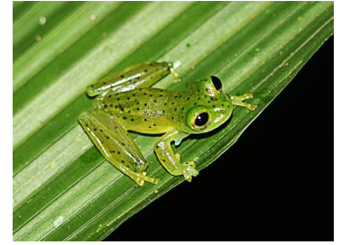
4 Espadarana prosoblepon (M) <32mm photo: MET CENTROLENIDAE