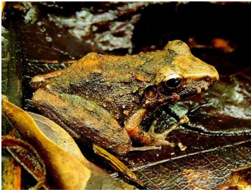
9 Craugastor crassidigitus <27mm CRAUGASTORIDAE