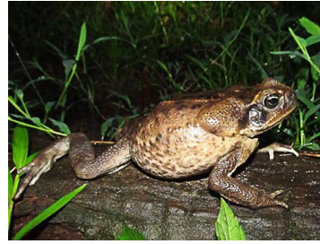
3 Rhinella marina <176mm photo: MET BUFONIDAE