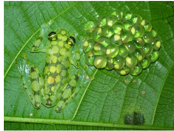
6 Hyalinobatrachium valerioi <27mm CENTROLENIDAE