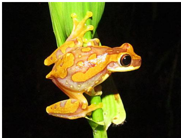
25 Dendropsophus ebraccata <36mm photo: MET HYLIDAE