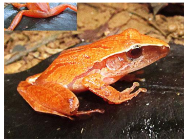
14 Craugastor noblei <67mm photo: MET CRAUGASTORIDAE