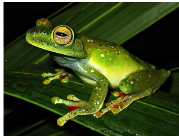
27 Boana rufitela <56mm HYLIDAE