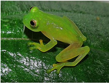
5 Hyalinobatrachium fleischmanni <32mm CENTROLENIDAE