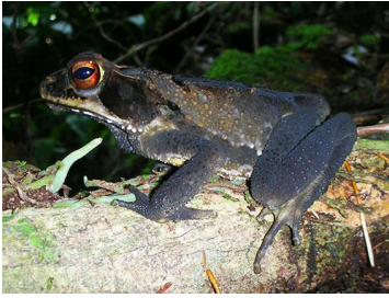
1 Incilius melanochlorus <104mm BUFONIDAE

[fieldguides.fieldmuseum.org] [860] version 2