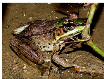
39 Lithobates vaillanti <126mm photo: HRV RANIDAE