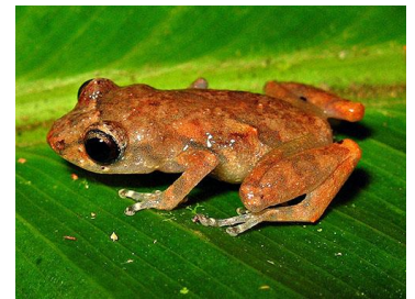
16 Diasporus diastema <25mm CRAUGASTORIDAE