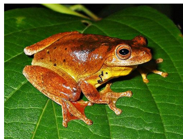
34 Tlalocohyla loquax <48mm HYLIDAE