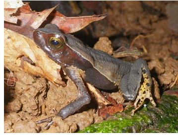
2 Rhaebo haematiticus <81mm BUFONIDAE