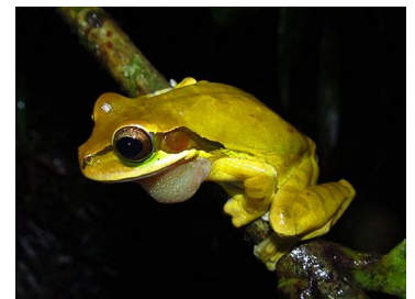
32 Smilisca phaeota <79mm photo: MET HYLIDAE