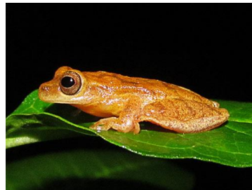
26 Dendropsophus phlebotodes <29mm HYLIDAE