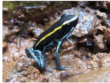
22 Phyllobates lugubris <25mm photo: MET DENDROBATIDAE