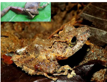
17 Pristimantis cerasinus <36mm CRAUGASTORIDAE