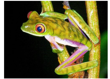
24 Agalychnis saltator <67mm HYLIDAE