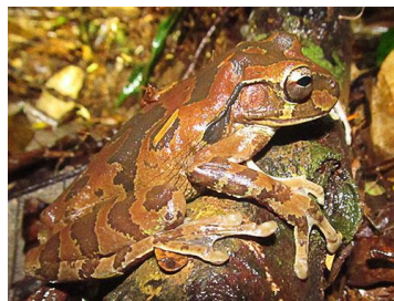
31 Smilisca baudinii <91mm HYLIDAE