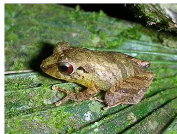
19 Pristimantis ridens <26mm photo: ESN CRAUGASTORIDAE