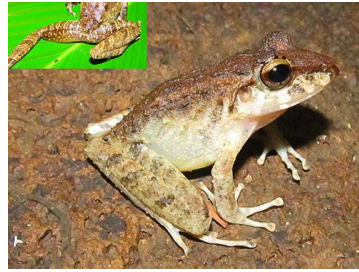
10 Craugastor fitzingeri <54mm CRAUGASTORIDAE