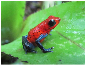
21 Oophaga pumilio <25mm photo: MET DENDROBATIDAE

[fieldguides.fieldmuseum.org] [860] version 2