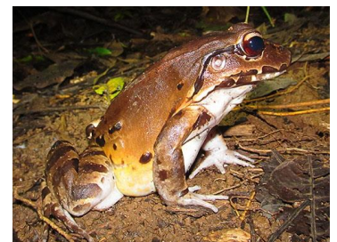
36 Leptodactylus savegei <186mm LEPTODACTYLIDAE