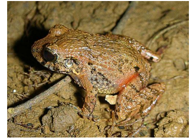
8 Craugastor bransfordii <27mm CRAUGASTORIDAE