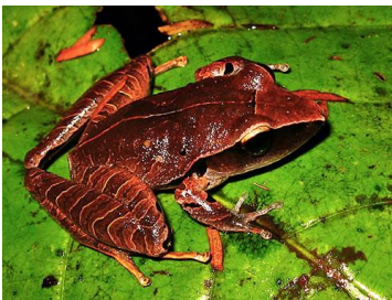
13 Craugastor mimus <59mm photo: JGA CRAUGASTORIDAE