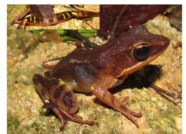
40 Lithobates warszewitschii <64mm photo: MET RANIDAE