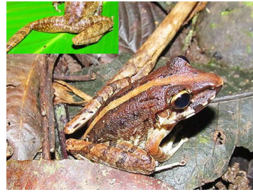
11 Craugastor fitzingeri <54mm CRAUGASTORIDAE