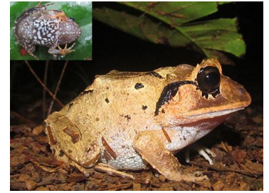
12 Craugastor megacephalus <71mm photo: MET CRAUGASTORIDAE