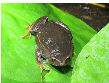
37 Hypopachus pictiventris <39mm MICROHYLIDAE