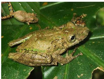
29 Scinax boulengeri <54mm HYLIDAE