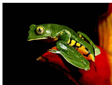
38 Cruziohyla sylviae <88mm photo: RGR PHYLLOMEDUSIDAE