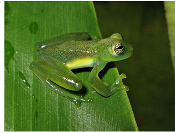
7 Teratohyla spinosa <24mm CENTROLENIDAE