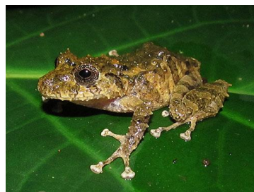
18 Pristimantis cruentus <43mm photo: MET CRAUGASTORIDAE