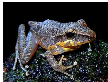
15 Craugastor talamancae <51mm CRAUGASTORIDAE