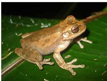
33 Smilisca puma <47mm HYLIDAE