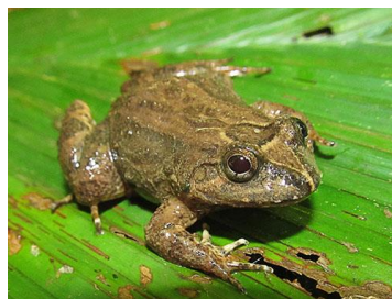
35 Leptodactylus melanonotus <56mm photo: MET LEPTODACTYLIDAE