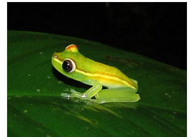
28 Boana rufitela (juv.) photo: MET HYLIDAE