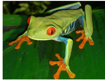
23 Agalychnis callidryas <78mm photo: ESN HYLIDAE