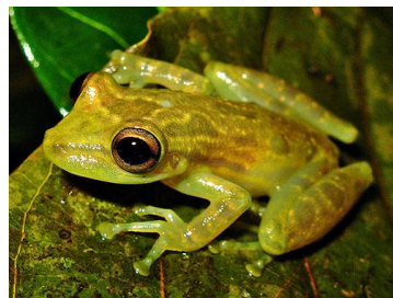
30 Scinax elaeochrous <41mm HYLIDAE