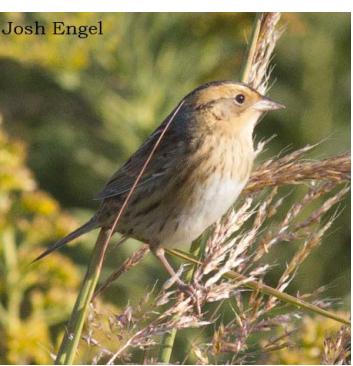
Nelson's Sparrow Ammodramus nelsoni EMBERIZIDAE

Field Marks: Small slender bill, buffy eye-ring, white belly, buffy breast with dark streaks and crisp dark streaks on flanks and breast