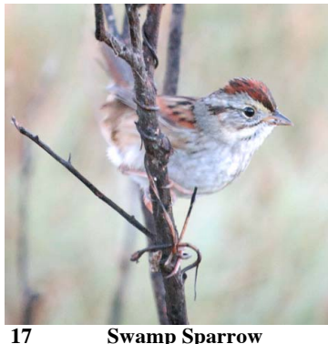
Swamp Sparrow Melospiza georgiana EMBERIZIDAE Preferred Habitat: Marshy areas bordered

Preferred Habitat: Wood edges, thickets and in bushes that are open or semi-open. Seasonal: Year-round resident Field Marks: Throat stripes radiate from central breast blotch, brown & gray crown stripes and coarse broad brown streaks on breast