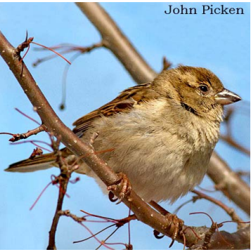
House Sparrow (female) 10

Seasonal: Year-round resident Field Marks: Stout yellowish-gray bill, black bib on throat & chest, gray head & belly and rufous neck