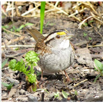
White-throated Sparrow Zonotrichia albicollis

September to late-October Field Marks: Pinkish-orange bill, black and white "bike helmet" crown, plain gray underside and broad white "eyebrow