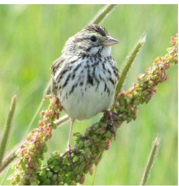
Savannah Sparrow 15 Passerculus sandwichensis

Preferred Habitat: Inland grassy fresh water marshes and wet prairies Seasonal: Mid to late-May and mid-September to late-October Field Marks: Bluish bill and bright orange face and breast. White belly with gray collar