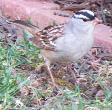
White-crowned Sparrow Zonotrichia leucophrys

Poecetes gramineus EMBERIZIDAE Preferred Habitat: Grassy and weedy fields, fallow or cultivated fields. Prefer drier areas with bushes or hedgegrows. Seasonal: Early-April to late-August Field Marks: White eye-ring, uniformly streaked back, pale white jaw line and off-white belly