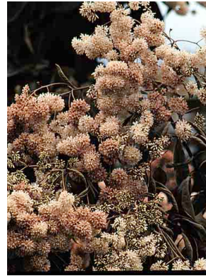
9 Cordia alliodora BORAGINACEAE