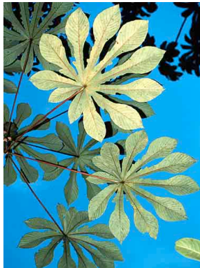
13 Cecropia polystachya CECROPIACEAE