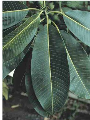
29 Ficus insipida MORACEAE