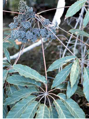
4 Schefflera morototoni ARALIACEAE