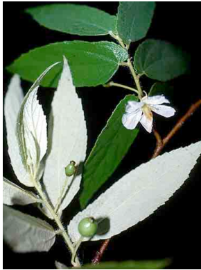
17 Muntingia calabura TILIACEAE (MUNTINGIACEAE)