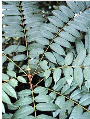
28 Cedrela fissilis MELIACEAE