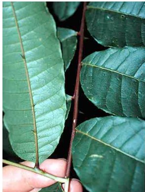
32 Zanthoxylum RUTACEAE