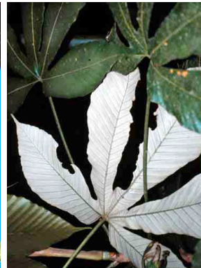
14 Pourouma bicolor CECROPIACEAE