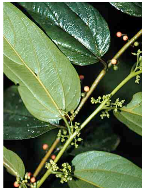
39 Trema micrantha ULMACEAE