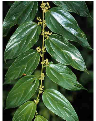
40 Trema micrantha ULMACEAE