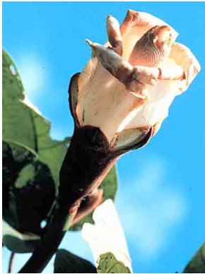
7 Ochroma pyramidale BOMBACACEAE