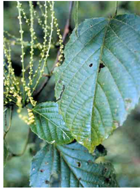
18 Aparisthium cordatum EUPHORBIACEAE