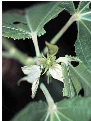
38 Heliocarpus americanus TILIACEAE