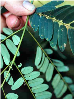
26 Schizolobium parahybum FABACEAE