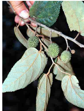
34 Guazuma tomentosa STERCULIACEAE