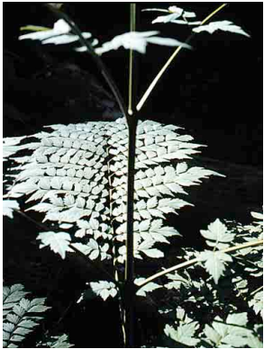
6 Jacaranda copaia BIGNONIACEAE