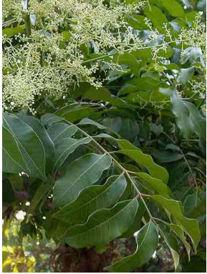
1 Spondias mombin ANACARDIACEAE