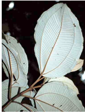
27 Miconia elata MELASTOMATACEAE