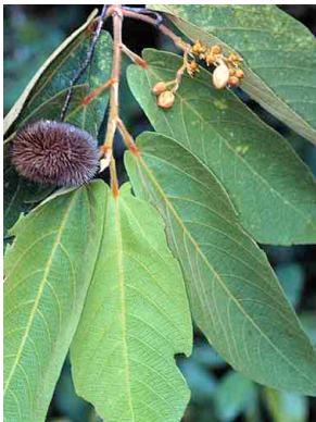
36 Apeiba tibourbou TILIACEAE