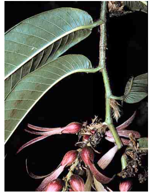
30 Triplaris poeppigiana POLYGONACEAE