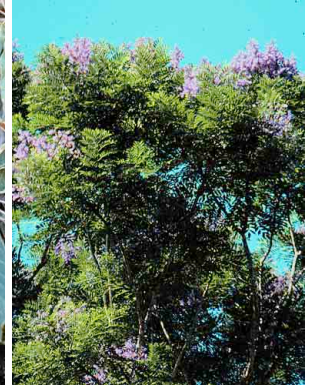
5 Jacaranda copaia BIGNONIACEAE