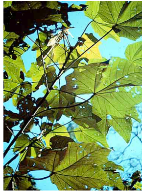
8 Ochroma pyramidale BOMBACACEAE