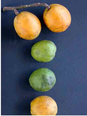
2 Spondias mombin ANACARDIACEAE