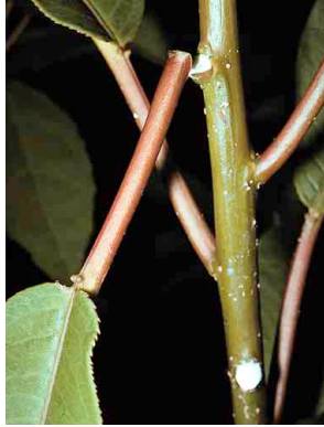
22 Sapium glandulosum EUPHORBIACEAE