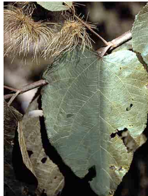
33 Guazuma crinita STERCULIACEAE