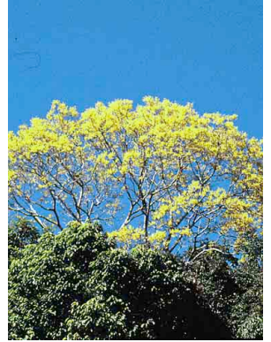
25 Schizolobium parahybum FABACEAE