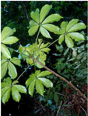
11 Jacaratia digitata CARICACEAE