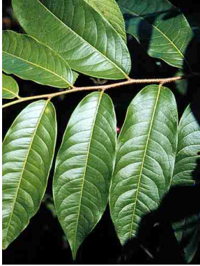
21 Margaritaria nobilis EUPHORBIACEAE