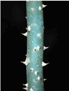
31 Zanthoxylum RUTACEAE