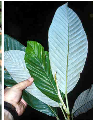
15 Pourouma minor CECROPIACEAE