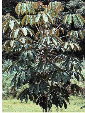
3 Schefflera morototoni ARALIACEAE