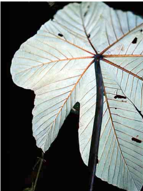
12 Cecropia gabrielis CECROPIACEAE