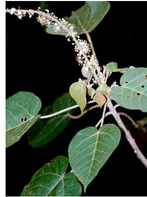
19 Croton lechleri EUPHORBIACEAE