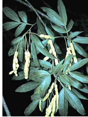
24 Inga marginata FABACEAE