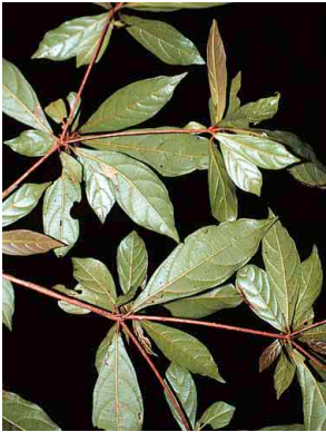
16 Terminalia amazonia COMBRETACEAE