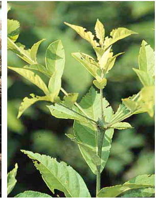
10 Cordia alliodora BORAGINACEAE