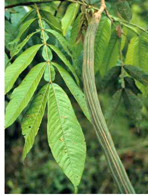
23 Inga edulis FABACEAE