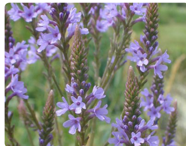
12 Verbena hastata Blue Vervain [JH]