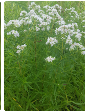
9 Pycnanthemum virginianum Mountain Mint [IR]