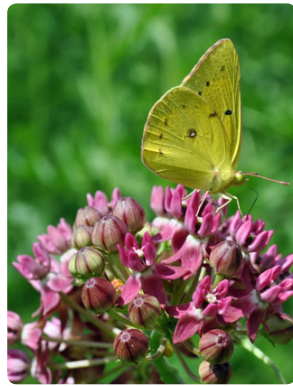
2 Asclepias incarnata Swamp Milkweed [LM]