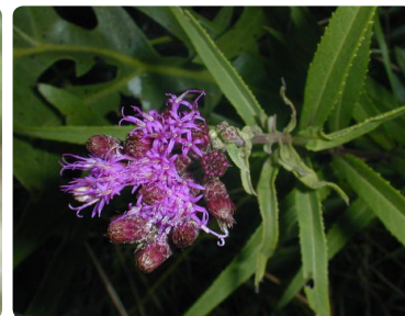
13 Veronia fasciculata Ironweed [JH]