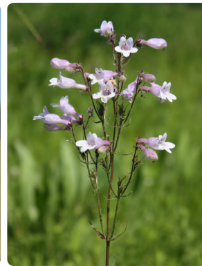
8 Penstemon digitalis Foxglove Beardtongue [IR]