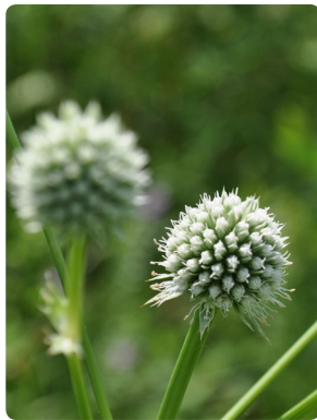
6 Eryngium yuccifolium Rattlesnake Master [LM]