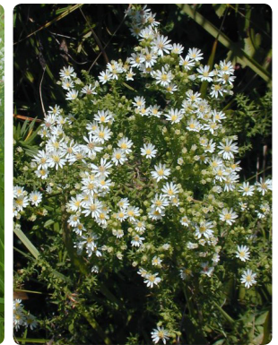
10 Symphyotrichum ericoides White Heath Aster [JH]