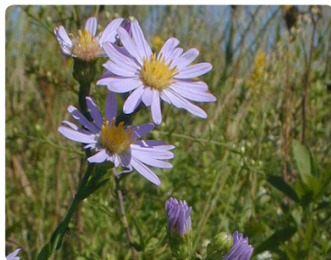
11 Symphyotrichum laeve Smooth Blue Aster [JH]