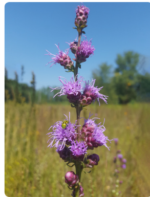
7 Liatris aspera Blazing Star [LM]