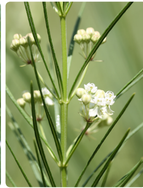
4 Asclepias verticillata Whorled Milkweed [IR]