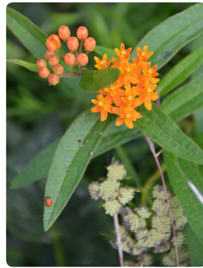
3 Asclepias tuberosa Butterflyweed [LM]