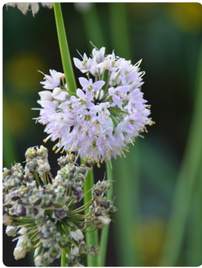
1 Allium cernuum Nodding Onion [LM]