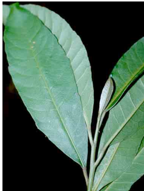
12 Croton EUPHORBIACEAE