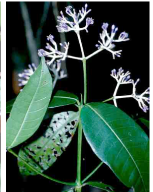
35 Faramea RUBIACEAE