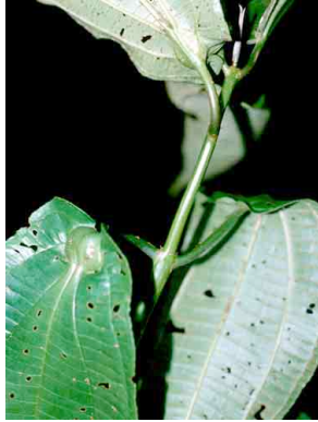
22 Tococa MELASTOMATACEAE