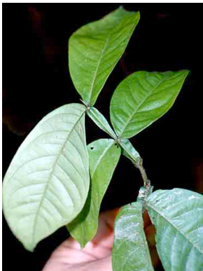
16 Inga FABACEAE-MIM