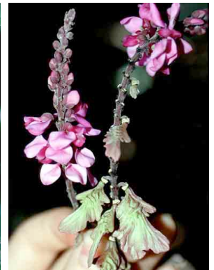
30 Securidaca POLYGALACEAE