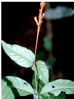
37 Palicourea RUBIACEAE