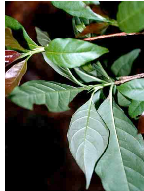
34 Bothriospora corymbosa RUBIACEAE