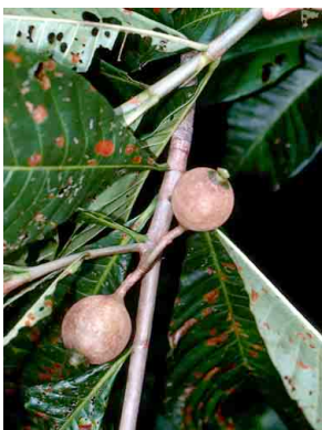
36 Genipa americana RUBIACEAE