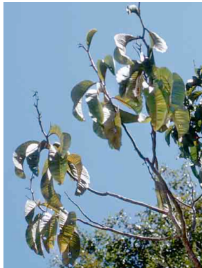
32 Triplaris POLYGONACEAE