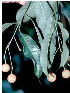
13 Mabea EUPHORBIACEAE