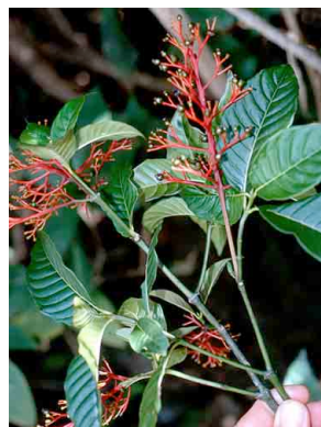
38 Palicourea RUBIACEAE