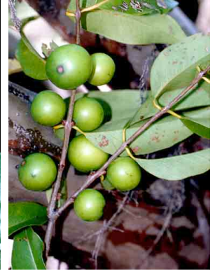
25 Myrciaria dubia MYRTACEAE