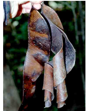
15 Campsiandra angustifolia FABACEAE-CAES