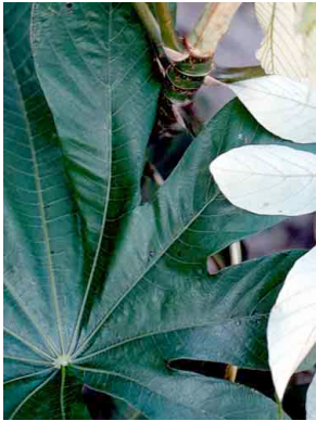
6 Cecropia CECROPIACEAE