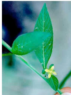
28 Ludwigia ONAGRACEAE