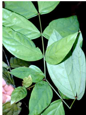
18 Zygia FABACEAE-MIM