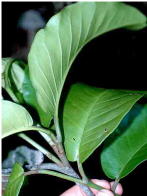
31 Coccoloba POLYGONACEAE