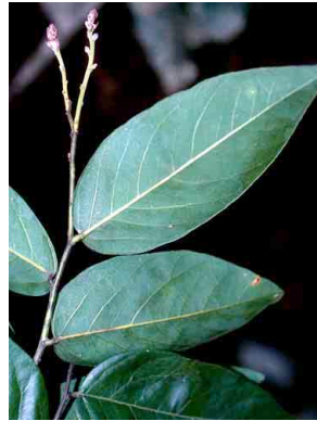
8 Hirtella CHRYSOBALANACEAE