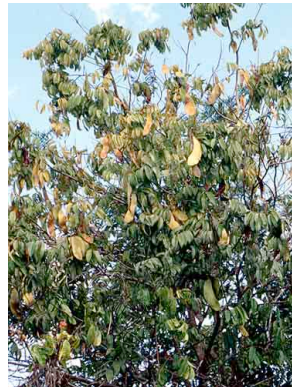
14 Campsiandra angustifolia FABACEAE-CAES