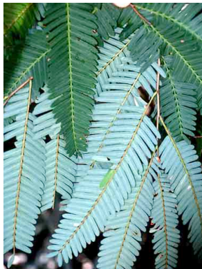
17 Macrolobium acaciifolium FABACEAE-CAES