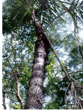
4 Astrocaryum jauari ARECACEAE