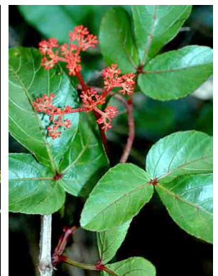
40 Cissus erosa VITACEAE