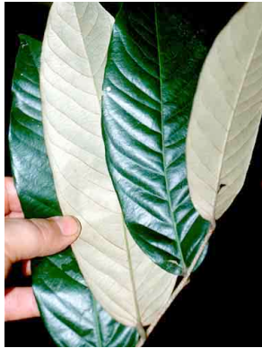
7 Couepia CHRYSOBALANACEAE