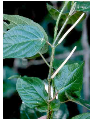
29 Piper crassinervium PIPERACEAE