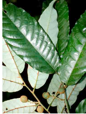
23 Virola MYRISTICACEAE