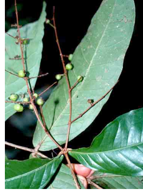
24 Calyptanthus MYRTACEAE