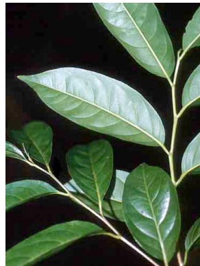
19 Casearia FLACOURTIACEAE