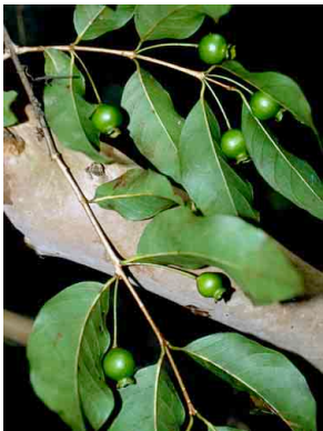
26 Psidium MYRTACEAE