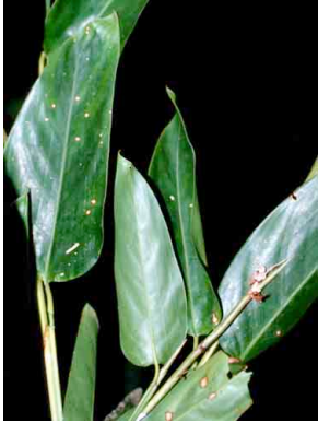
21 Ischnosiphon MARANTACEAE

© Environmental & Conservation Programs, The Field Museum, Chicago, IL 60605 USA. [RRC@fmnh.org] Rapid Color Guide # 129 version 1.0