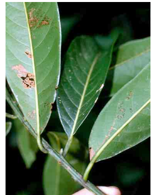
20 Pleurothyrium LAURACEAE