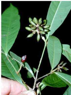
27 Neea NYCTAGINACEAE