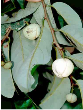
1 Annona hypoglauca ANNONACEAE

© Environmental & Conservation Programs, The Field Museum, Chicago, IL 60605 USA. [RRC@fmnh.org] Rapid Color Guide # 129 version 1.0