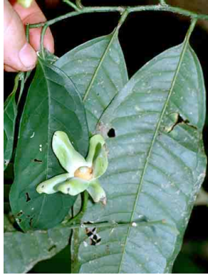
2 Guatteria ANNONACEAE