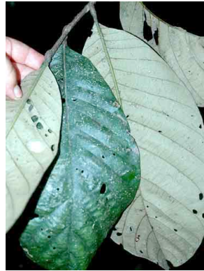
9 Licania CHRYSOBALANACEAE