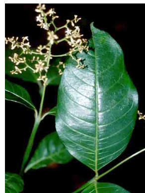
39 Psychotria RUBIACEAE