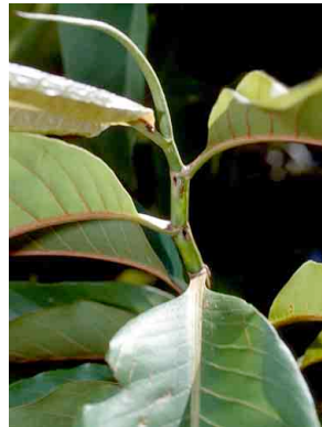
33 Triplaris POLYGONACEAE