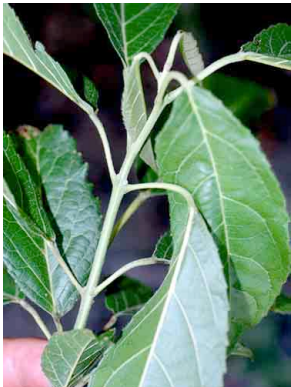
11 Alchornea EUPHORBIACEAE