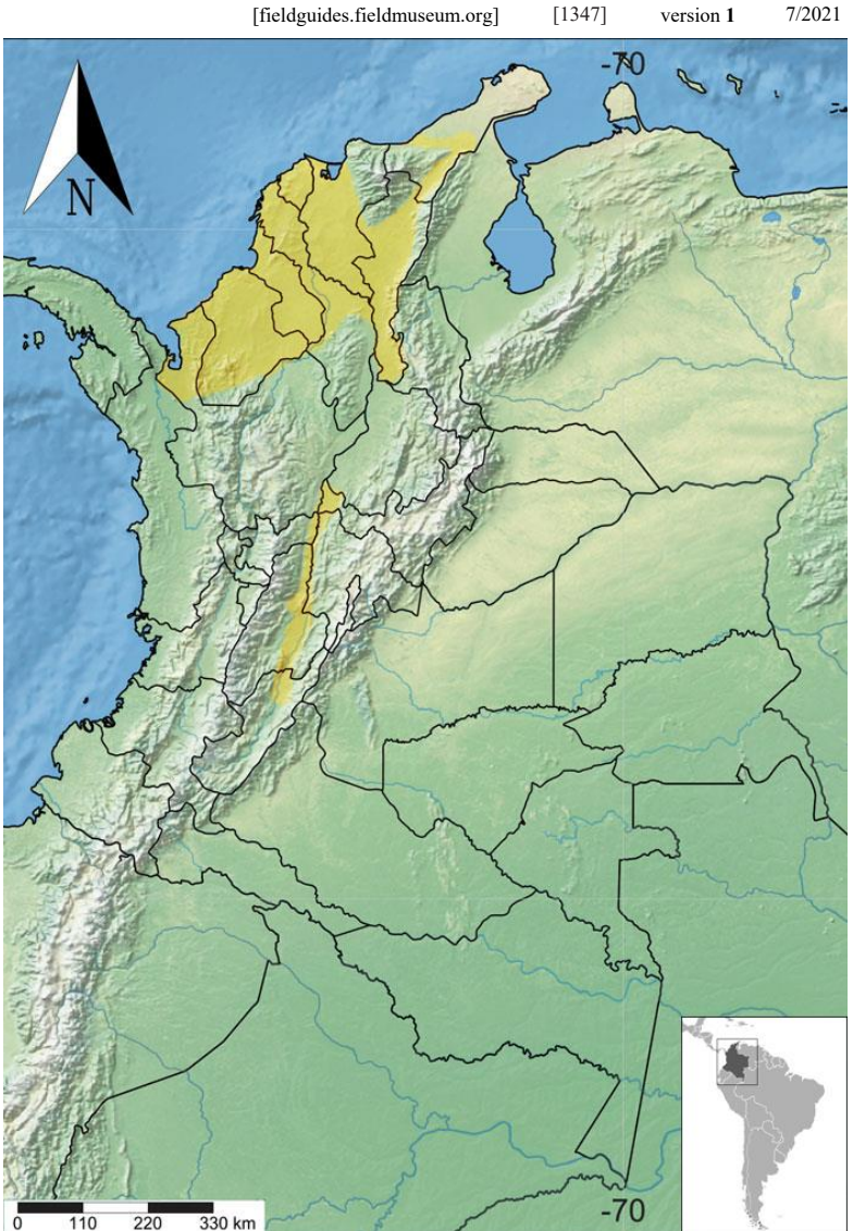
Geographical distribution: E. panamensis in Colombia Global conservation status: Least Concern (LC)