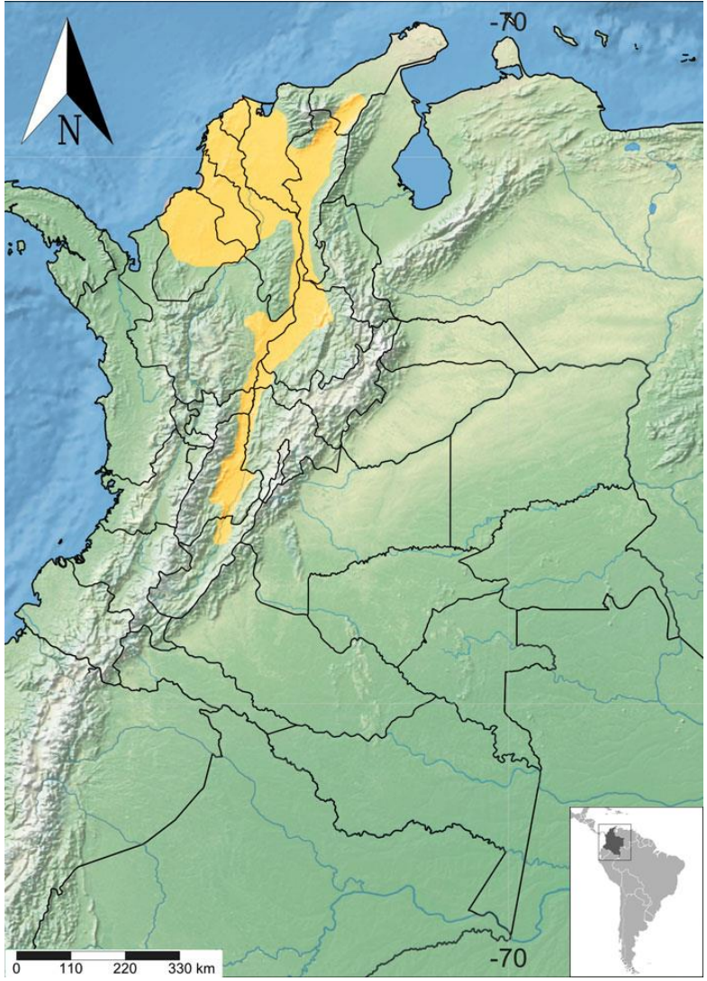
Geographical distribution: E. pearsei in Colombia Global conservation status: Least Concern (LC)