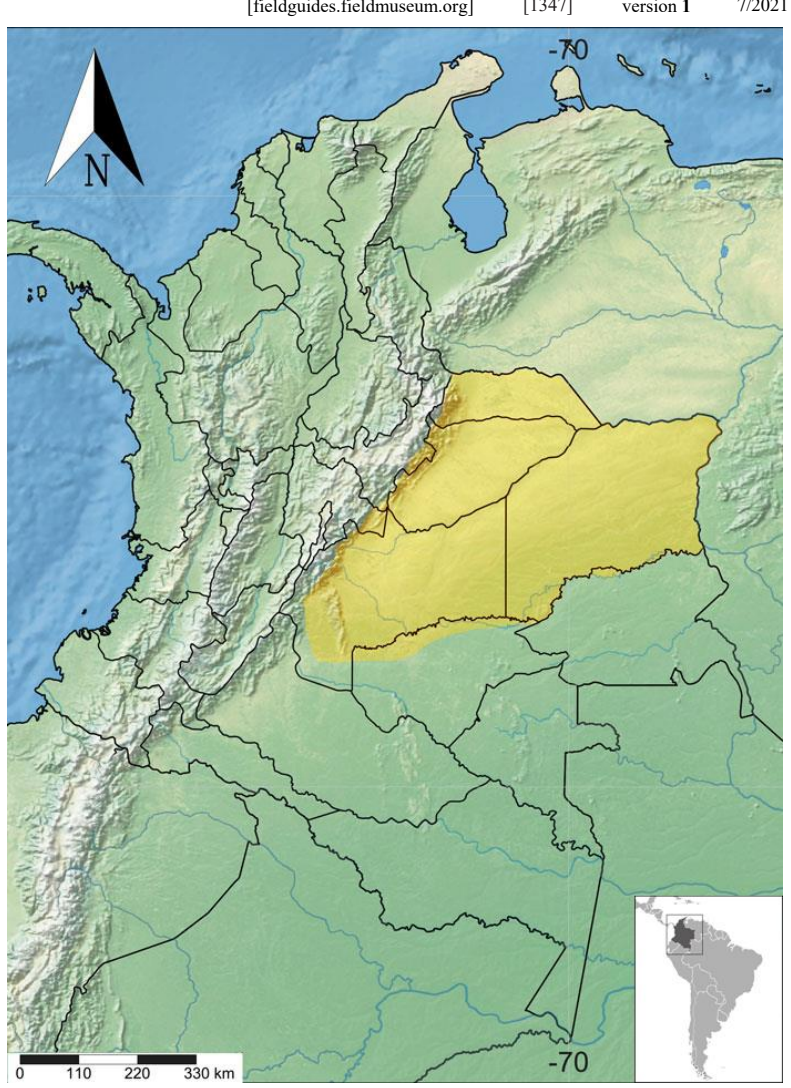
Geographical distribution: E. ovalis in Colombia Global conservation status: Least Concern (LC)

Caramaschi (2010), considered it a nomen dubium; for Caramshi (2010) the status of populations outside of Brazil is unsettled Elachistocleis pearsei Dunn, 1944. Scale: 5 mm