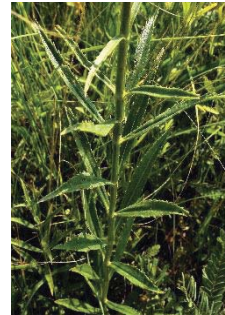
Physostegia virginiana LAMIACEAE Obedient Plant N, [p. 23]

Habitat: Prairie Woodland, Blooming Period: Early to mid-Summer lasting about 3 weeks.