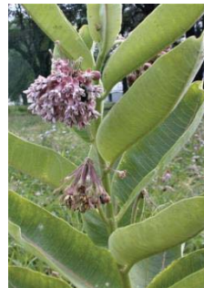
Asclepias syriaca APOCYNACEAE Common Milkweed N, [p. 8]

Habitat: Prairie, Blooming Period: Early to mid-Summer lasting about 1 - 1½ months.