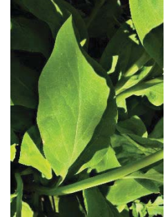
Mertensia virginica CAMPANULACEAE Virginia Bluebells N, [p. 21]

Habitat: Woodland, Blooming Period: Mid- to late Spring lasting about 3 weeks.