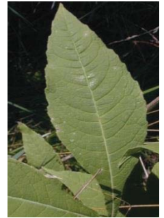
Verbesina alternifolia (Actinomeris a.) ASTERACEAE Wingstem N , [p. 29]

Habitat: Savanna, Blooming Period: Late Summer to early Fall lasting about 1-1½ months.