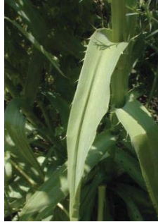
Eryngium yuccifolium APIACEAE Rattlesnake Master N, [1] p. 15

Habitat: Prairie Blooming Period: Mid- to late Summer.