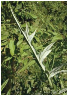
Cirsium discolor ASTERACEAE Pasture Thistle N, [p. 12]

Habitat: Prairie, Blooming Period: Late Summer to Fall lasting about one month.