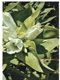
Gentiana alba GENTIANACEAE Cream Gentian N, [p. 17]

Habitat: Prairie, Blooming Period: Late Summer lasting about 1 or 1½ months.