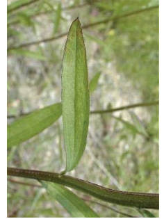
Erigeron strigosus ASTERACEAE Daisy Fleabane N, [p. 31]

Habitat: Prairie, Blooming Period: Late Spring to mid-Summer lasting about 1-2 months for a colony of plants.