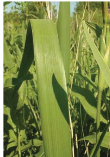
Iris virginica var. shrevei IRIDACEAE Blue Flag Iris N, [p. 18]

Habitat: Wetland, Blooming Period: Late Spring to early Summer lasting about one month.