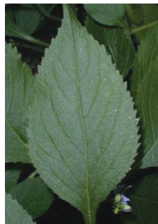
Campanulastrum americanum CAMPANULACEAE American Bellflower N, [p. 10]

Habitat: Woodland, Blooming Period: Mid-Summer to early Fall lasting 1½ months.