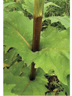
Silphium perfoliatum ASTERACEAE Cup Plant N , [p. 27]

Habitat: Prairie, Blooming Period: Early to mid-Summer lasting about 1-1½ months.