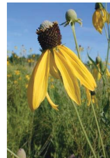
Ratibida pinnata ASTERACEAE Yellow Headed Coneflower N, [p. 25]

Habitat: Prairie, Blooming Period: Early to late Summer lasting about 1-2 months.