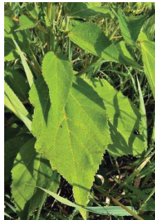
Hibiscus moscheutos MALVACEAE Swamp Rose Mallow N, [p. 18]

Habitat: Prairies, Wetland Blooming Period: Late summer to early fall, and lasts about 1½ months.