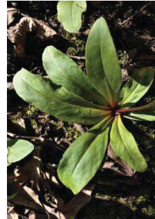
Dodecatheon meadia PRIMULACEAE Shooting Star N , [p. 14]

Habitat: Prairie, Blooming Period: Late Spring lasting about one month.