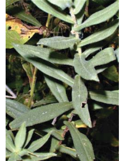
Symphyotrichum novae-angliae ASTERACEAE New England Aster N, [p. 9]

Habitat: Prairie, Blooming Period: Late Summer to Fall lasting about 2 months.