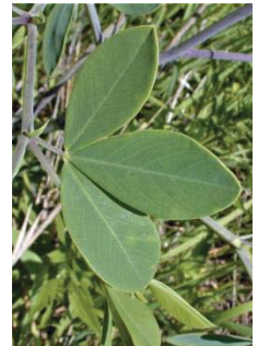
Baptisia alba var. macrophylla FABACEAE White Wild Indigo N, [p. 9]

Habitat: Prairie, Blooming Period: Late Spring to mid-Summer lasting about 1-1½ months.