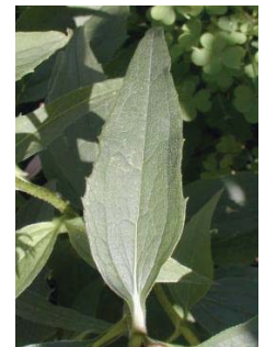
Echinacea purpurea ASTERACEAE Purple Coneflower N, [p. 15]

Habitat: Prairie, Blooming Period: Mid- Summer lasting about one month.