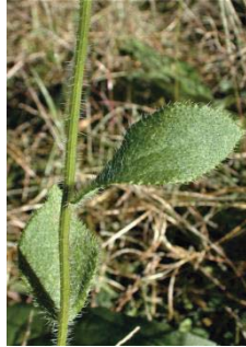
Rudbeckia hirta ASTERACEAE Black-Eyed Susan N , [p. 25]

Habitat: Prairie, Blooming Period: Early to late Summer lasting about one month.