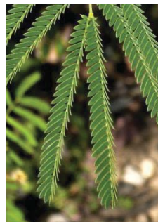
Desmanthus illinoensis FABACEAE Illinois Bundleflower N, [p. 14]

Habitat: Prairie, Blooming Period: Summer lasting 1-2 months.