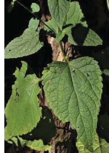
Ageratina altissima ASTERACEAE White Snakeroot N, [p. 6]

Habitat: Woodland, Blooming Period: Late Summer through Fall lasting about 2 months for a colony of plants