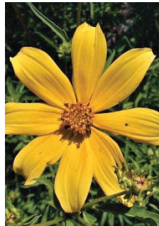
Bidens polylepis ASTERACEAE Tickseed Sunflower N, [p. 9]

Habitat: Prairie and Seeps, Blooming Period: Late Summer to early Fall lasting about 1-2 months.