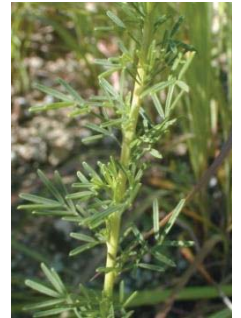
Dalea purpurea FABACEAE Purple Prairie Clover N, [p. 14]

Habitat: Prairie, Blooming Period: Early to mid-Summer lasting about 1- 1½ months.