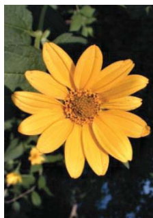
Heliopsis helianthoides ASTERACEAE False Sunflower N, [p. 17]

Habitat: Prairie, Blooming Period: Early Summer to early Fall lasting about one month.