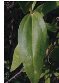
Gentiana andrewsii GENTIANACEAE Bottle Gentian N, [p. 17]

Habitat: Prairie, Blooming Period: Late Summer to early Fall lasting one month.