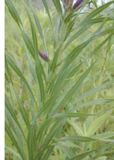
Liatris spicata ASTERACEAE Marsh Blazingstar N, [p. 19]

Habitat: Wetland, Blooming Period: Mid-to late Summer lasting about 3 weeks.