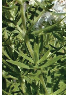
Pycnanthemum virginianum LAMIACEAE Common Mountain Mint N , [p. 24]

Habitat: Prairie, Blooming Period: Mid-Summer lasting about one month.