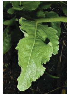
Parthenium integrifolium ASTERACEAE Wild Quinine N, [p. 22]

Habitat: Prairie, Blooming Period: Late Spring to mid-Summer lasting 2 months.