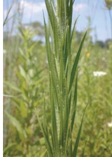
Liatris pycnostachya ASTERACEAE Prairie Blazingstar N, [p. 19]

Habitat: Prairie, Blooming Period: Late Summer lasting about one month.