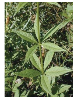
Veronicastrum virginicum SCROPHULARIACEAE Culver's Root N , [p. 30]

Habitat: Prairie, Blooming Period: Early to mid-Summer lasting about one month.