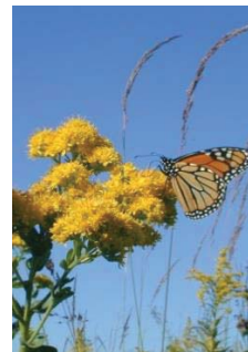
Oligoneuron rigidum (Solidago rigida) ASTERACEAE Stiff Goldenrod N, [p. 21]

Habitat: Prairie, Blooming Period: Late Summer to Fall lasting about one month.