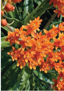
Asclepias tuberosa APOCYNACEAE Butterfly Milkweed N, [p. 8]

Habitat: Prairie, Savanna and open rocky Woodland. Blooming Period: Early to mid- Summer.