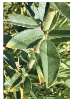
Lespedeza capitata FABACEAE Round-Headed Bush Clover N, [p. 19]

Habitat: Prairie, Blooming Period: Late Summer to early Fall lasting about one month.