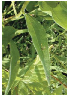
Echinacea pallida ASTERACEAE Pale Purple Coneflower N, [p. 14]

Habitat: Prairie, Blooming Period: Early Summer lasting about 3 weeks.