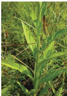
Lobelia cardinalis CAMPANULACEAE Cardinal Flower N , [p. 20]

Habitat: Wetland, Blooming Period: Late Summer to early Fall lasting about 1-1½ months.