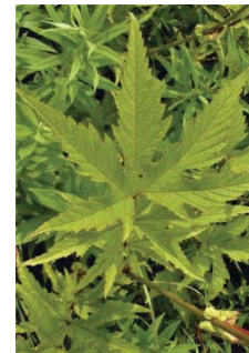
Filipendula rubra ROSACEAE Queen-of-the-Prairie N, [p. 16]

Habitat: Wetland, Blooming Period: Early to mid-Summer lasting about 3 weeks.