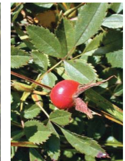
Rosa carolina ROSACEAE Pasture Rose N, [p. 25]

Habitat: Prairie, Blooming Period: Early Summer lasting about one month.