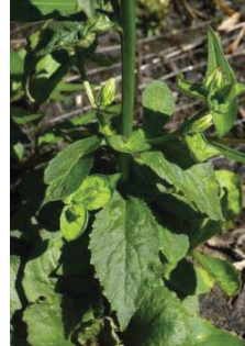
Lobelia siphilitica CAMPANULACEAE Great Blue Lobelia N, [p. 20]

Habitat: Wetland, Blooming Period: Late Summer into Fall lasting about 2 months.