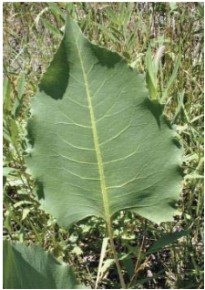
Silphium terebinthinaceum ASTERACEAE Prairie Dock N , [p. 27]

Habitat: Prairie, Blooming Period: Late Summer to early Fall lasting about one month.