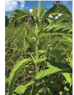
Teucrium canadense LAMIACEAE American Germander N, [p. 28]

Habitat: Prairie Marshes, Blooming Period: Mid- to late Summer lasting about 1½ month.