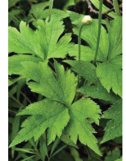
Anemone virginiana RANUNCULACEAE Tall Anemone N , [p. 8]

Habitat: Prairie, Savanna and Woodland Blooming Period: Early Summer.