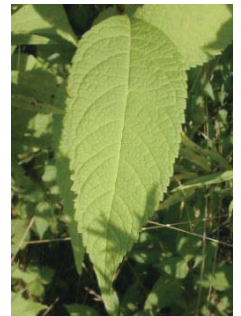
Eutrochium purpureum ASTERACEAE Sweet Joe-Pye Weed N, [p. 16]

Habitat: Savanna Blooming, Period: Mid-Summer to early Fall lasting about one month.