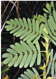
Chamaecrista fasciculata FABACEAE Partridge Pea N , [p. 12]

Habitat: Prairie, Blooming Period: Quite long, from mid-Summer to Fall.