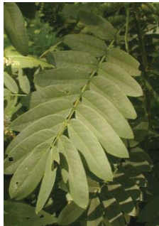
Senna marilandica (Cassia marilandica) FABACEAE Maryland Senna N , [p. 27]

Habitat: Savanna, Blooming Period: Mid- to late Summer lasting about 3-4 weeks.