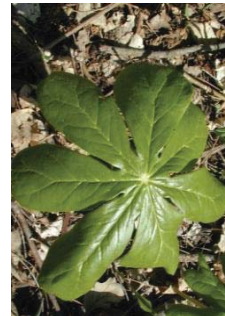
Podophyllum peltatum BERBERIDACEAE Mayapple N, [1] p. 23

Habitat: Woodland, Blooming Period: Mid- to late Spring lasting about 2-3 weeks.