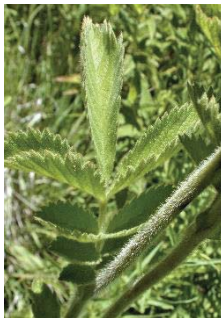
Drymocallis arguta (Potentilla arguta) ROSACEAE Prairie Cinquefoil N , [p. 24]

Habitat: Prairie, Blooming Period: Mid-Summer lasting about one month.