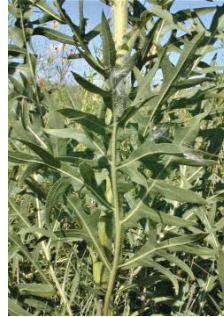
Silphium laciniatum ASTERACEAE Compass Plant N , [p. 27]

Habitat: Prairie, Blooming Period: Mid-Summer lasting about 1½ months.