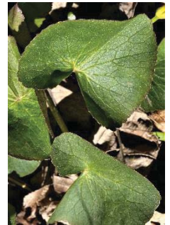
Caltha palustris RANUNCULACEAE Marsh Marigold N , [1] p. 10

Habitat: Wetlands, Blooming Period: Mid-Spring lasting about one month.