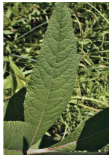
Vernonia missurica ASTERACEAE Missouri Ironweed N, [p. 30]

Habitat: Prairie, Blooming Period: Late Summer to early Fall lasting about one month.