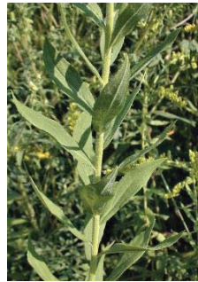
Solidago altissima ASTERACEAE Tall Goldenrod N , [p. 27]

Habitat: Prairie, Blooming Period: Late Summer to Fall individual plants bloom about 3 weeks.