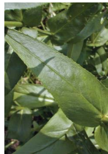
Penstemon digitalis SCROPHULARIACEAE Foxglove Penstemon N , [p. 22]

Habitat: Prairie, Blooming Period: Late Spring lasting about one month