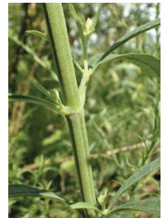
Salvia azurea var. grandiflora LAMIACEAE Wild Blue Sage N, [p. 26]

Habitat: Prairie, Blooming Period: Late Summer and Fall lasting about 1-2 months.