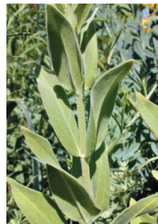
Silene regia CARYOPHYLLACEAE Royal Catchfly NI , [p. 27]

Habitat: Prairie, Blooming Period: Mid- to late Summer lasting about one month.