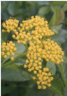
Zizia aurea APIACEAE Golden Alexanders N, [p. 30]

Habitat: Prairie, Blooming Period: Late Spring to early Summer lasting about one month.