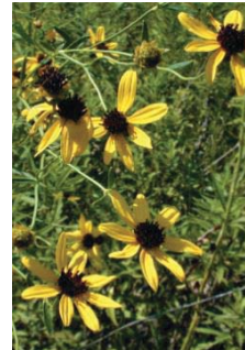
Coreopsis tripteris ASTERACEAE Tall Coreopsis N, [p. 13]

Habitat: Prairie, Blooming Period: Mid- Summer to early Fall lasting about one month.