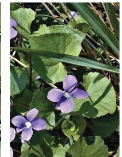
Viola pratensis VIOLACEAE Common Blue Violet N, [p. 30]

Habitat: Prairie, Blooming Period: Mid- to late Spring lasting 1-1½ months.