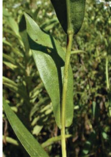
Symphyotrichum laeve ASTERACEAE Smooth Blue Aster N, [p. 9]

Habitat: Prairie and Savanna, Blooming Period: From late Summer to Fall.