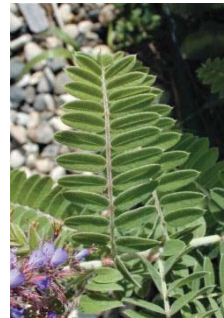
Amorpha canescens FABACEAE Leadplant N, [p. 7]

Habitat: Prairie, Blooming Period: Early to mid-Summer lasting about 1½ months.