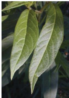
Asclepias incarnata APOCYNACEAE Swamp or Rose Milkweed N, [p. 8]

Habitat: Wetland, Blooming Period: Late Summer lasting about one month.