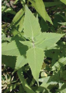
Monarda fistulosa LAMIACEAE Wild Bergamot N, [p. 21]

Habitat: Prairie, Blooming Period: Mid-Summer lasting about 3 weeks.