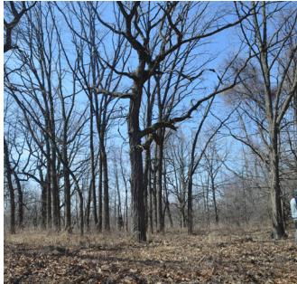
Oak Savanna Community

Before European settlement, Beaubien Woods was a wet prairie and open savanna community. The oak savannas of the Midwest form a transition zone between the drier Great Plains to the west and the broadleaf forests to the east. There are five acres of oak savanna at Beaubien today.