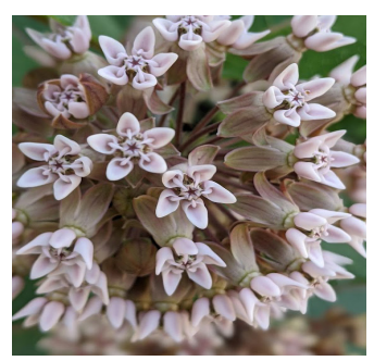
2 Common Milkweed Asclepias syriaca The most common milkweed, its leaves are the food for monarch caterpillars.