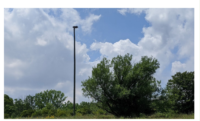
Osprey Nesting Platform Near Boat Launch Keep your eyes to the sky in warmer months for these fish-eating raptors, as well as for bald eagles that have been known to fly overhead.

Provides a scenic overlook and is located at E 132nd St, east of S Greenwood Ave, Chicago, IL 60827. The parking lot and ramp allow access to the Little Calumet River and have interpretive signage and a small pavilion.