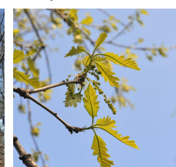
4 Bur Oak Quercus macrocarpa Provides habitat for hundreds of living organisms and works as a backbone to the ecosystem.