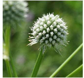
1 Rattlesnake Master Eryngium yuccifolium The scientific name of this plant, means "like yucca leaves."