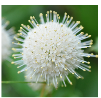
8 Buttonbush Cephalanthus occidentalis This native wetland shrub attracts 24 birds and numerous butterfly species.