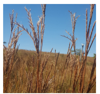
3 Big Bluestem Andropogon gerardii The state grass of Illinois, also called "turkey foot," due to the shape of its seedhead.