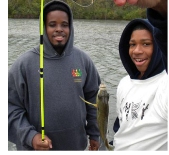
7 Largemouth Bass Micropterus salmoides Largemouth bass, bluegill, and redear sunfish are commonly stocked in the lake.