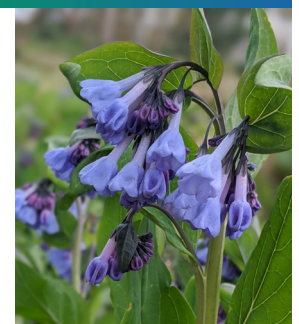
5 Mertensia virginica Virginia bluebells