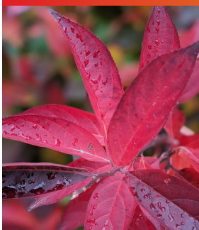
1 Cornus sericea Red-osier dogwood