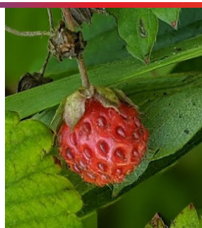
7 Fragaria virginiana Wild strawberry