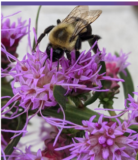
6 Liatris aspera Rough blazing star