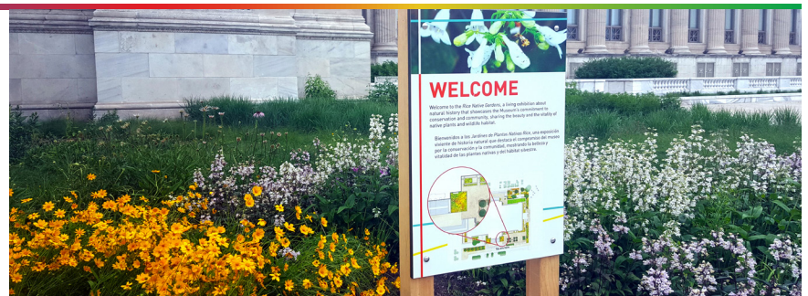
The Rice Native Gardens, The Field Museum, Chicago, Illinois