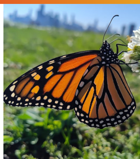
2 Danaus plexippus Monarch butterfly