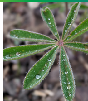
4 Lupinus perennis Blue lupine