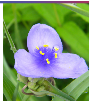
12 Tradescantia ohiensis Spiderwort