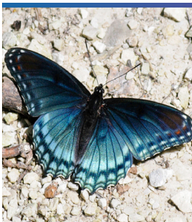
11 Limenitis arthemis astyanax Red-spotted purple