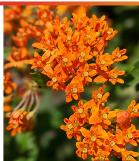
8 Asclepias tuberosa Butterfly weed