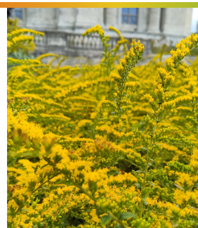
9 Solidago rugosa 'Fireworks' Rough goldenrod