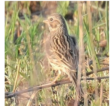
4 Calcarius pictus SMITH'S LONGSPUR Female Buffy, finely streaked, slight but sharply pointed bill, black tail with white outer feathers. MIG M