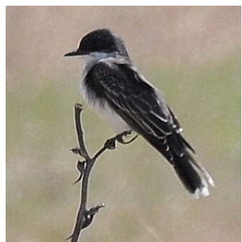
17 Tyrannus tyrannus EASTERN KINGBIRD

Bright-yellow underparts and striking black chevron across chest. LVL 2 N