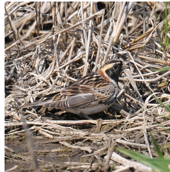
3 Calcarius lapponicus LAPLAND LONGSPUR Chunky bird with broad bill, males have black crown, face and bib, and rusty nape. M