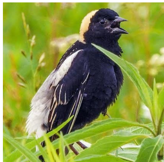
9 Dolichonyx oryzivorus BOBOLINK Male Black with white back and rump, rich buffy nape, short neck and tail, pointed bill. LVL 1 N