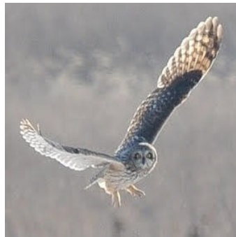
2 Asio flammeus SHORT-EARED OWL Brown spotted with buff and white on underparts, face pale, yellow eyes, breast streaked with brown. MIG IL-E