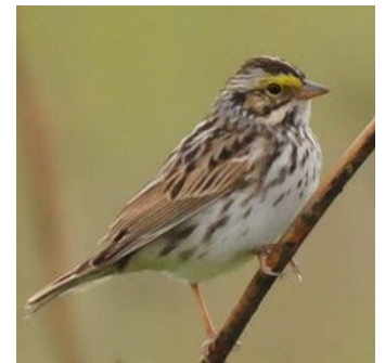
12 Passerculus sandwichensis SAVANNA SPARROW Short tail, small head, and telltale yellow spot before the eye. N