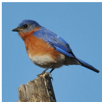
14 Sialia sialis EASTERN BLUEBIRD

Streaky brown sparrow has thin white eye ring, flashes white tail feathers. N