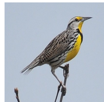
16 Sturnella magna EASTERN MEADOWLARK

A chunky bunting is colored like a miniature meadowlark, with black V on yellow chest. LVL 3 N