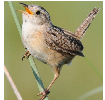
8 Cistothorus platensis SEDE WREN Small wren with round belly, streaked back, banded wings, short tail held upright. LVL 2 N