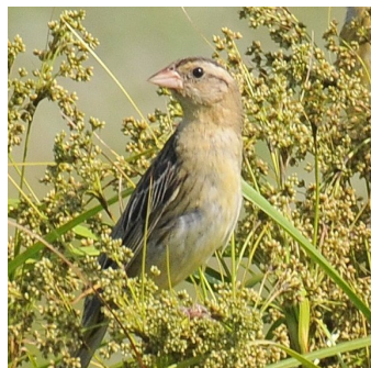
10 Dolichonyx oryzivorus BOBOLINK Female Warm buffy brown, dark brown streaks on the back and flanks, bold brown stripes on the crown. LVL 1 N