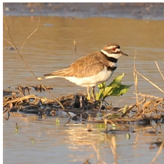
6 Charadrius vociferus KILDEER Tan/buff, greenish-washed face, sharp black stripes and orange rump. N