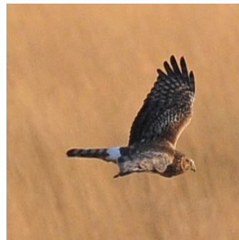
7 Circus hudsonius NORTHERN HARRIER Slim with long-tail, holds wings in V-shape, white patch at base of tail, male grey and white. MIG LVL 3 W