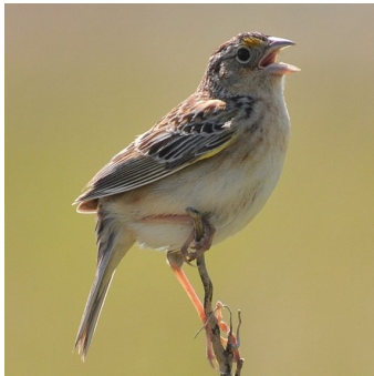
1 Ammodramus savannarum GRASSHOPPER SPARROW Buffy tan, unstreaked underparts contrast with brown, gray, orange above; flat head, large bill. LVL 2 N

The Birds of Concern (BOC) in the Chicago Wilderness (CW) region is a list of species needing priority attention and management. This BOC list was developed using numerous national and state conservation organizations' lists of species of conservation concern.