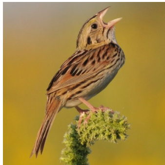
5 Centronyx henslowii HENSLow'S SPARROW Flat-topped, large, olive-tinged head, short tail; white chest with two black bands and white patches. LVL 1 N