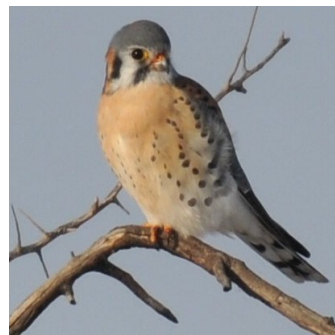
11 Falco sparverius AMERICAN KESTREL Slate-blue head, wings contrast elegantly with rusty-red back and tail. LVL 3 N