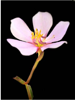
1 Acisanthera bivalvis

Rapid Color Guide # 377 version 1 04/2013