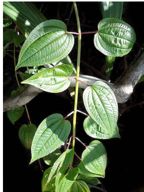
13 Nepsera aquatica