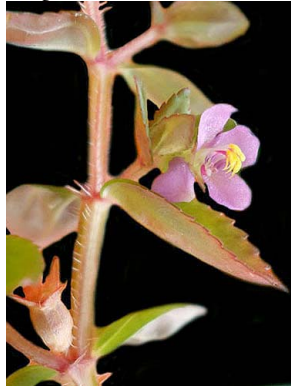
3 Acisanthera hedyotideia