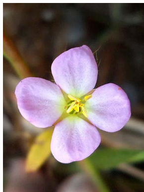
18 Pterolepis polygonoides