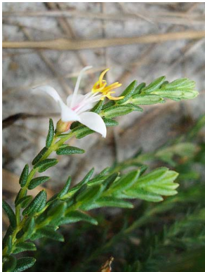
11 Marcetia taxifolia