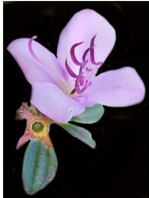
8 Comolia villosa