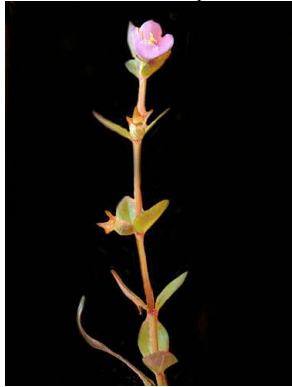
2 Acisanthera hedyotideia