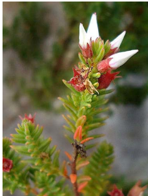
12 Marcetia taxifolia