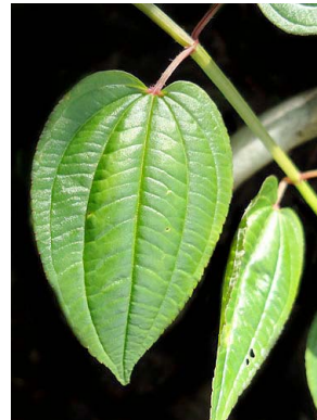
14 Nepsera aquatica