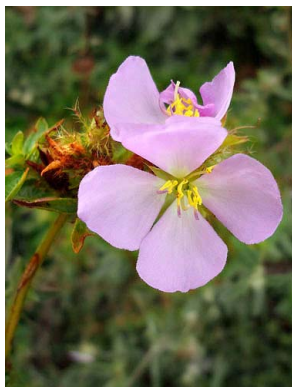
17 Pterolepis glomerata