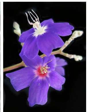
20 Tibouchina heteromalla