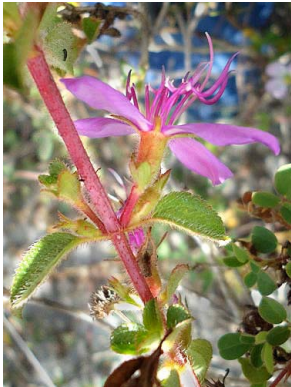
6 Comolia ovalifolia