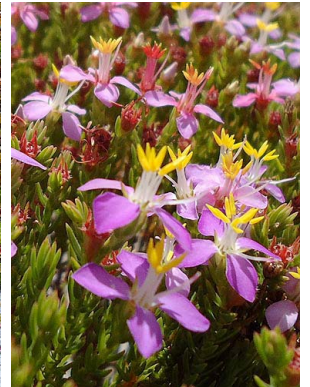
10 Marcetia ericoides