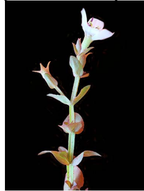
4 Acisanthera limnobios