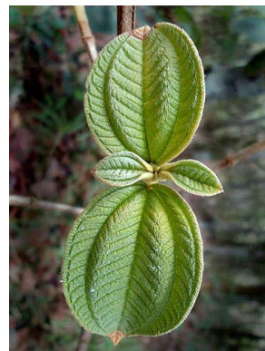
19 Tibouchina heteromalla