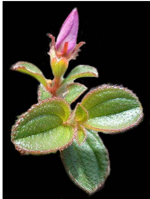
7 Comolia villosa