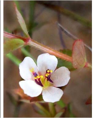
5 Acisanthera limnobios