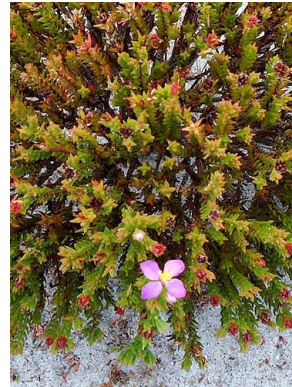
9 Marcetia ericoides