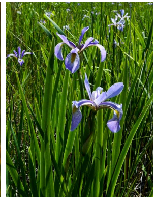
Virginia Iris Iris virginica var. shrevei