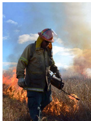
Contractors conduct the first ever prescription burn of the site