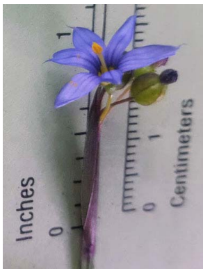
American Blue-eyed grass Sisyrinchium montanum