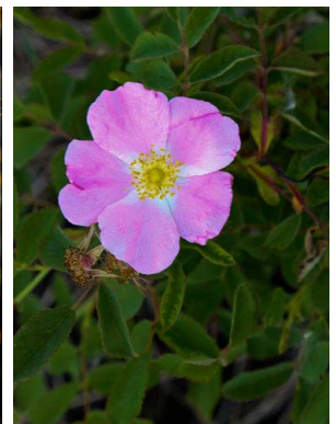
Smooth Rose Rosa blanda