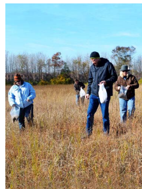
Arcelor staff collect native prairie seeds to expand the restoration area at the site