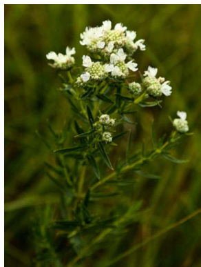
Virginia Mountain mint Pycnanthemum virginianum