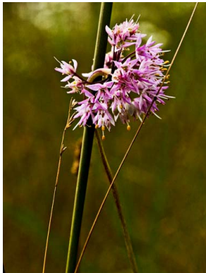
Nodding Onion Allium cernuum

Museum ecologists noted the site’s unique topography, undisturbed sandy soils, and a few native plants growing in the rougher areas of the site. These were all clues that something very special lay beneath the mowed field. These suspicions were confirmed when mowing of the area ceased and thousands of native plants emerged. A plant inventory in 2015 already documented over 75 species of plants, including one state-endangered species, Mountain Blue-eyed Grass, and two state-threatened species, Golden and Prairie Hummock Sedge. An ecological contractor has also been hired to control invasive species and weeds within the dune and swale habitat. A new walking trail around the site and interpretive signage invite visitors to explore and watch this beautiful piece of Indiana’s heritage come back to life.