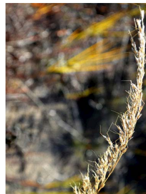
Indiangrass Sorghastrum nutans