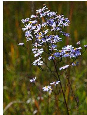
Skyblue Aster Symphotrichum oolentangiense