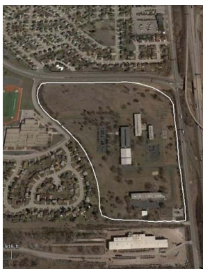
Research and Development Center Dune and Swale Trail Map