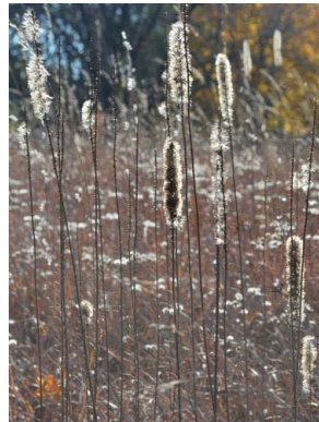
Dense Blazing Star Liatriis spicata