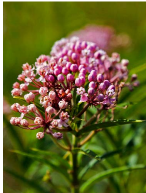
Swamp Milkweed Asclepias incarnata