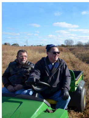
Arcelor staff check on the progress of and watch the prescribed fire November 2016