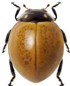
9 Cycloneda limbicollis