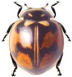
1 Adalia angulifera