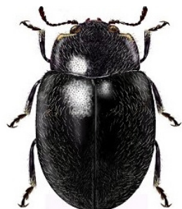
17 Eupaleoides chiloensis