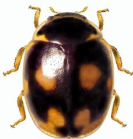
21 Hyperaspis festiva