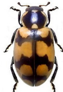
11 Eriopis chilensis