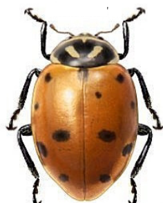
19 Hippodamia convergens