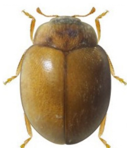
26 Nothocolus sp.