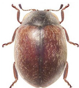
25 Nothocolus sicardi