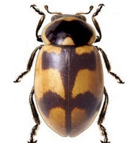
12 Eriopis eschscholtzii