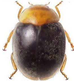
38 Scymnus bicolor