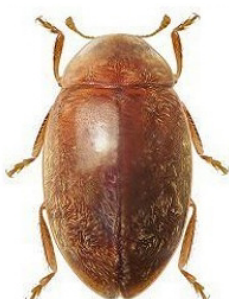
30 Orynipus kuscheli