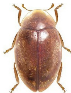
31 Orynipus ultimensis