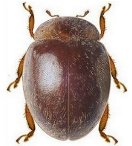
36 Rhyzobius sp.