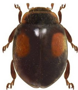
22 Neorhizobius fuegensis