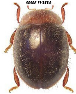
35 Rhyzobius lophanthae