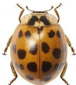
18 Harmonia axyridis