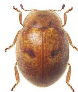
32 Paracranoryssus chilianus