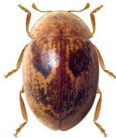
6 Cranoryssus variegatus