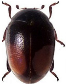
33 Parasidis brethesi