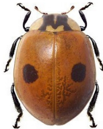
2 Adalia bipunctata