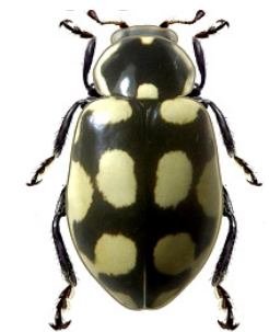
16 Eriopis sp.