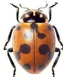
20 Hippodamia variegata