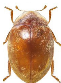
28 Orynipus chilensis