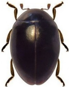
5 Coccidophilus sp.