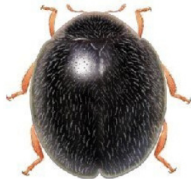
34 Parastethorus histrio