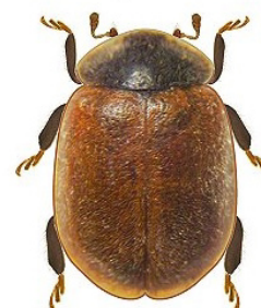
24 Neoryssomus variabilis