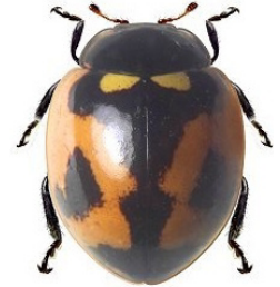
4 Adalia kuscheli