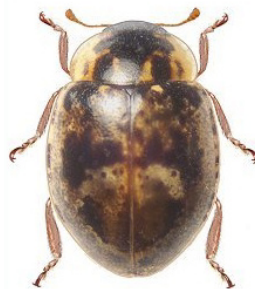
40 Stenadalia nigrodorsata