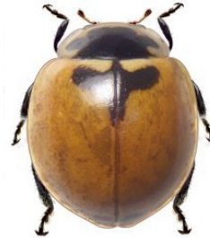
3 Adalia deficiens