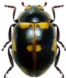
10 Cycloneda patagonica