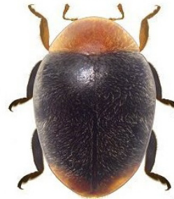
7 Cryptolaemus montrouzieri