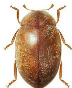
29 Orynipus darwini