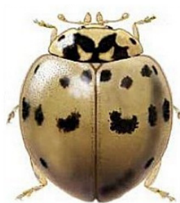
27 Olla v-nigrum