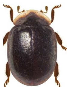
23 Neoryssomus germainii