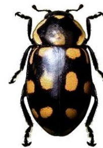
15 Eriopis opposita