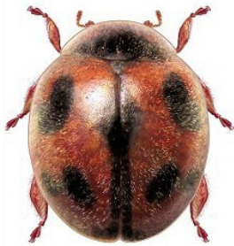
37 Novius cardinalis