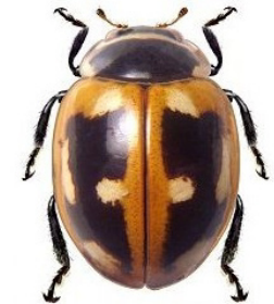
8 Cycloneda germainii