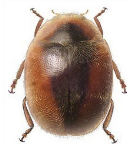
39 Scymnus loewii