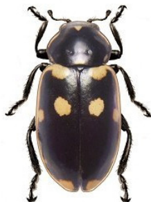
14 Eriopis magellanica